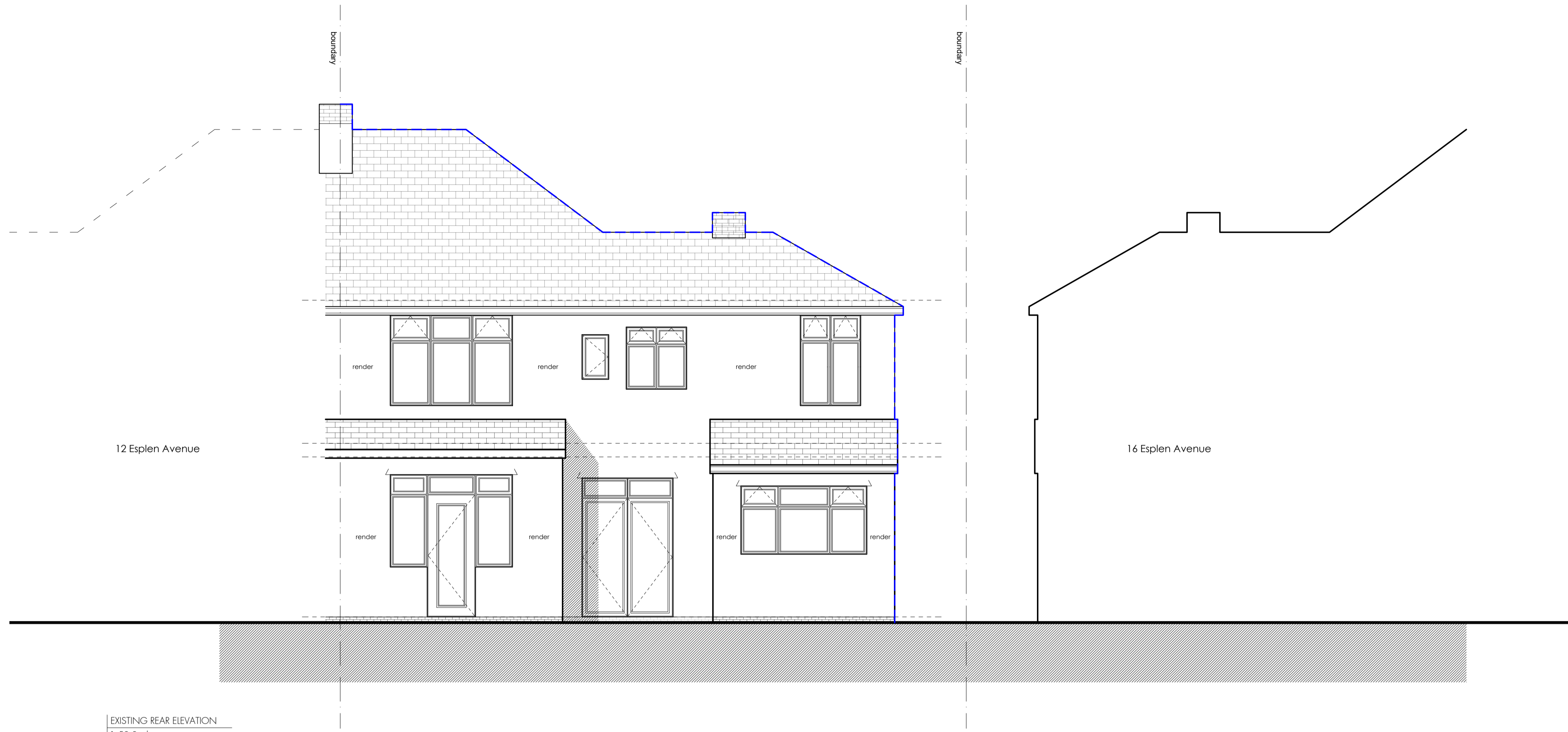
EXISTING REAR ELEVATION 1:50 Scale