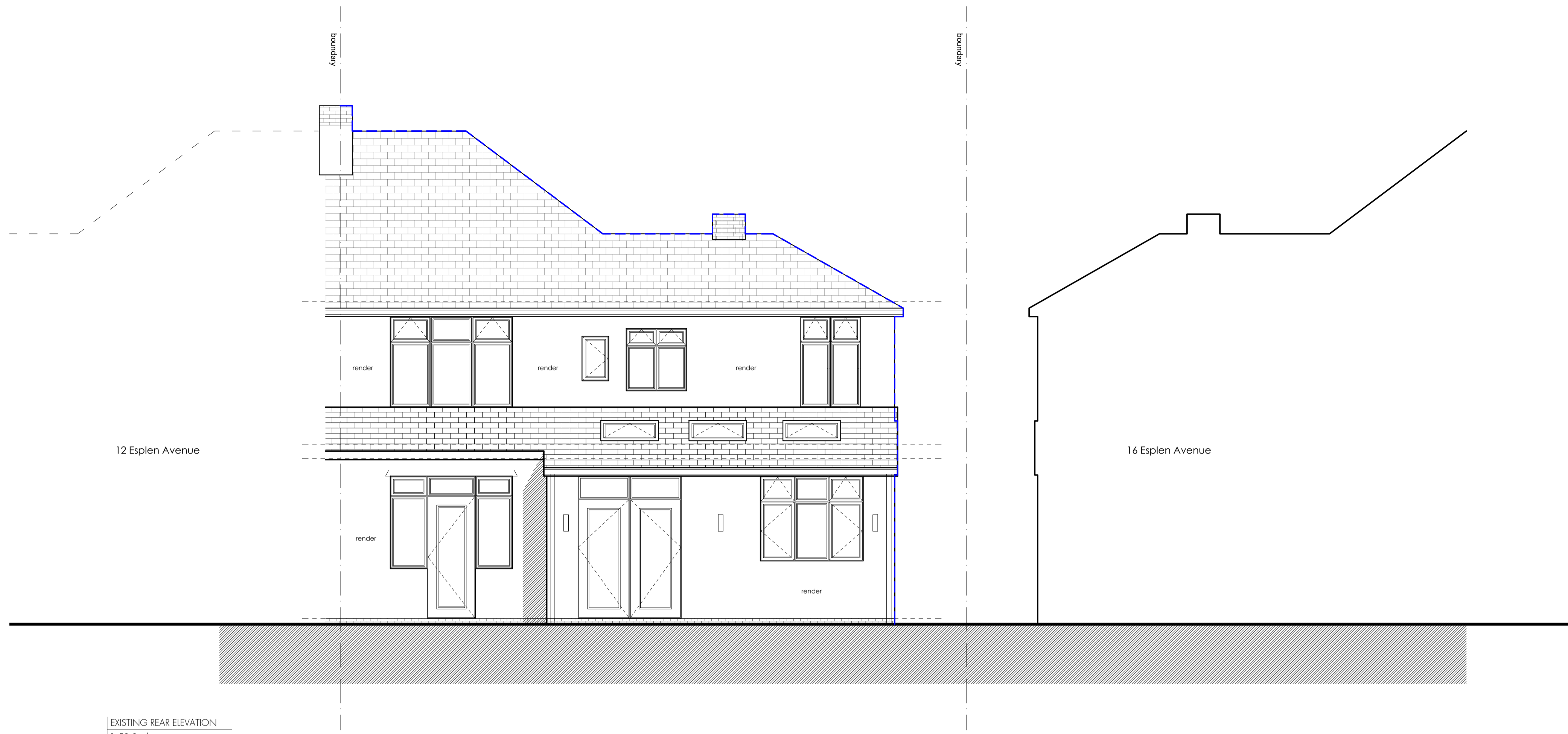
EXISTING REAR ELEVATION 1:50 Scale