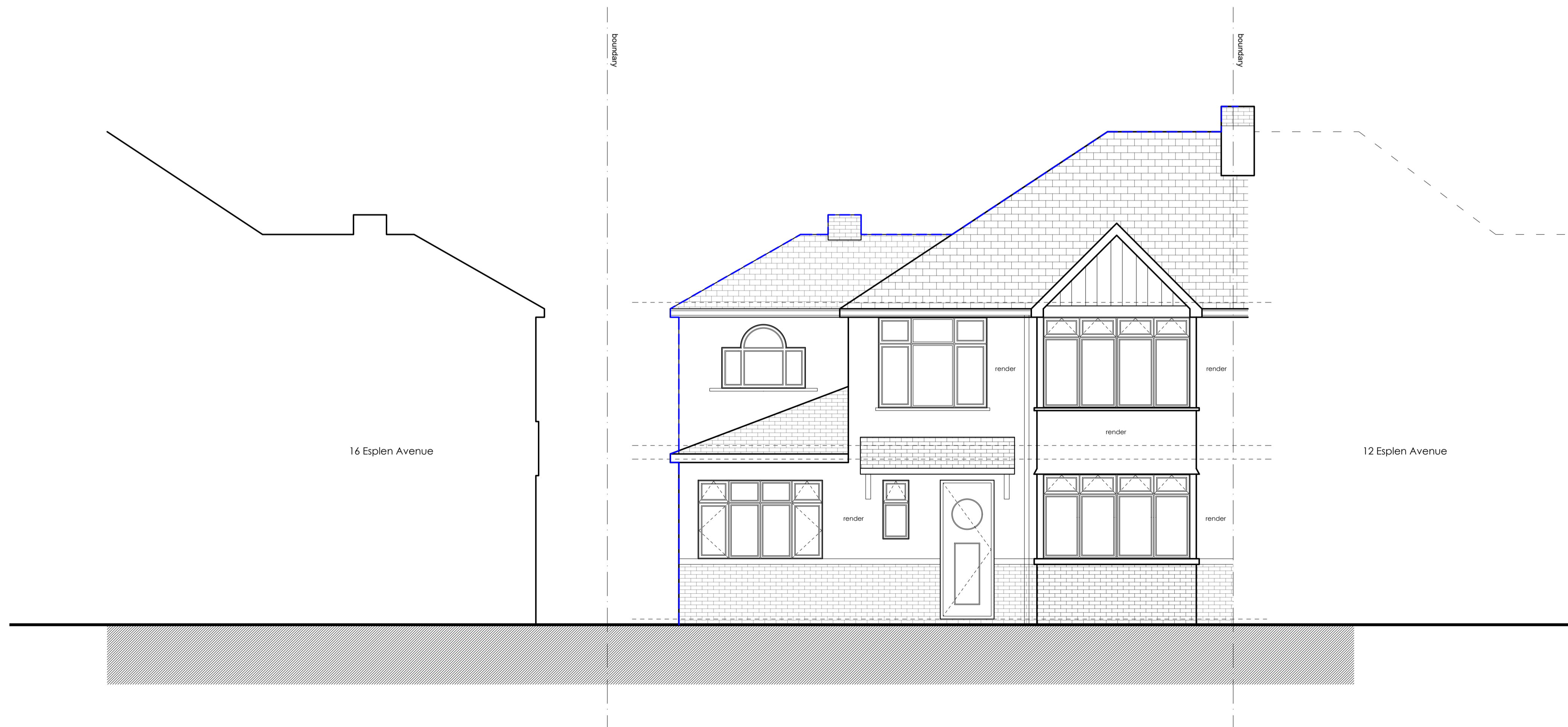
PROPOSED FRONT ELEVATION 1:50 Scale (AS EXISTING)