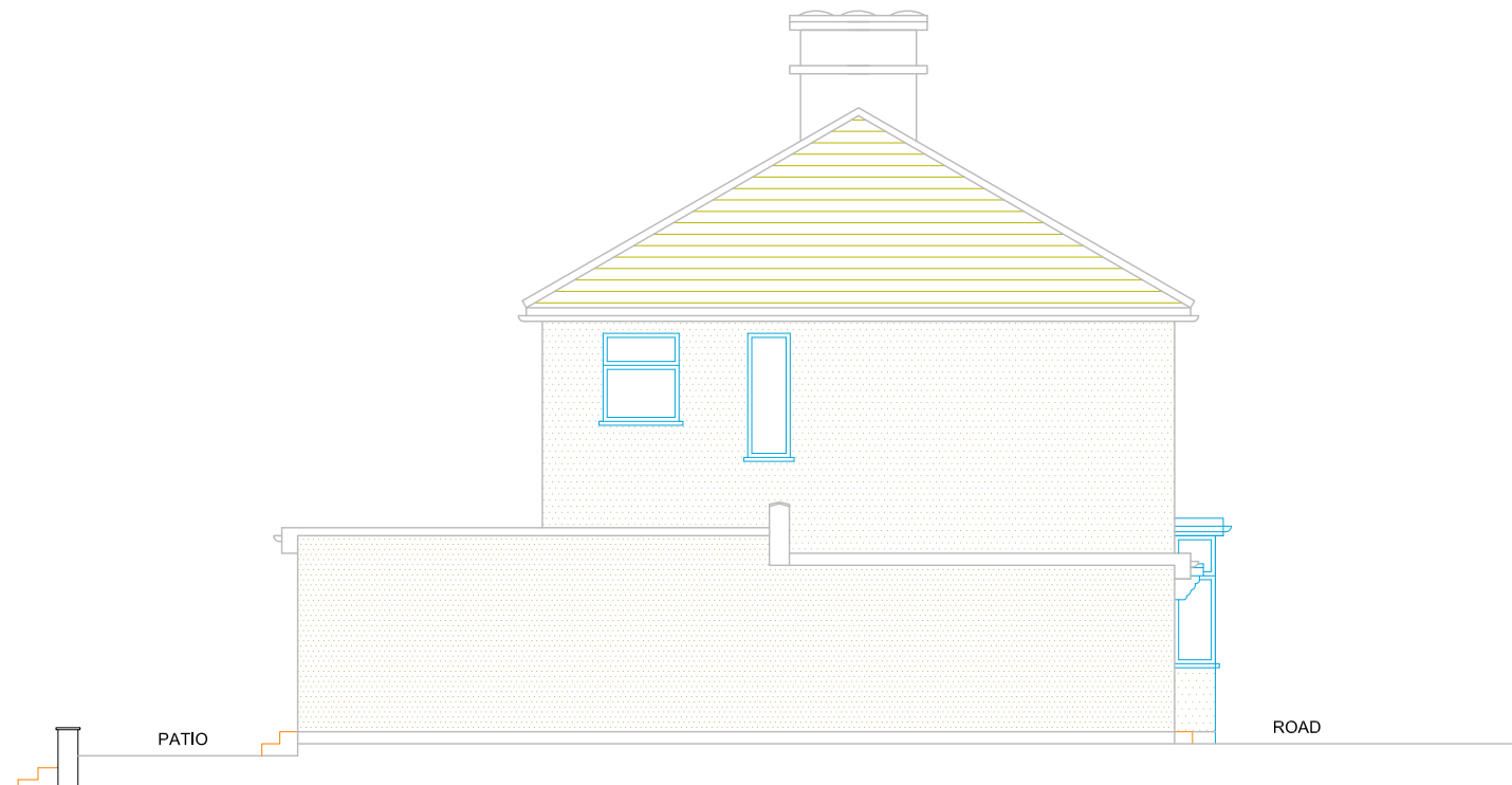
EXISTING SIDE ELEVATION-2