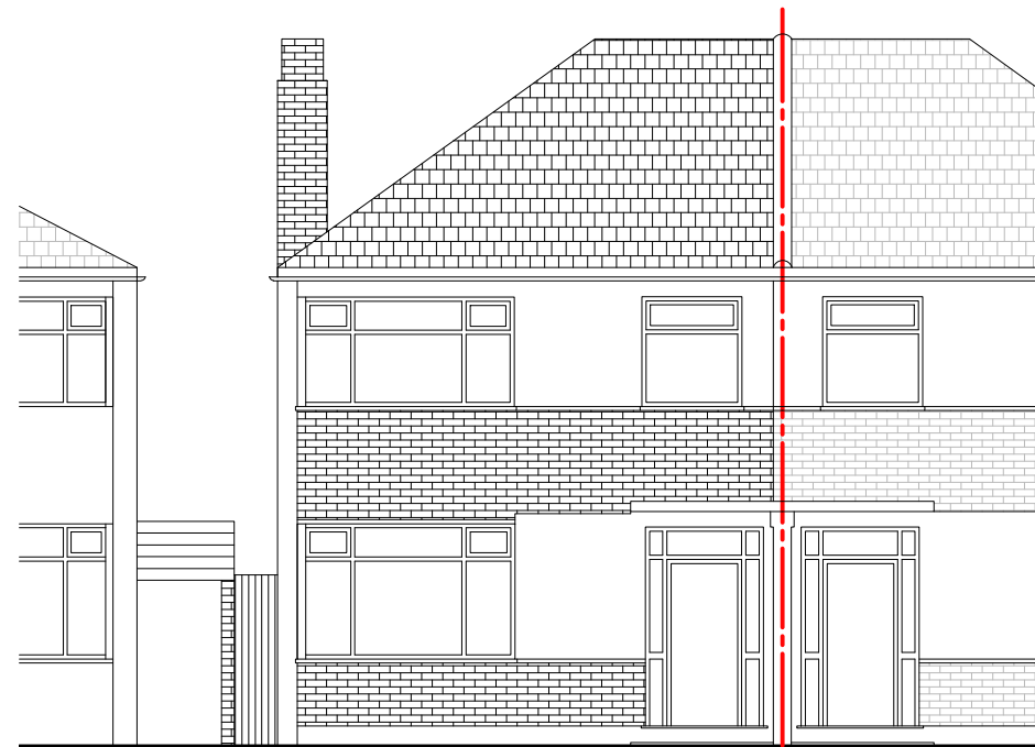
EXISTING / PROPOSED FRONT ELEVATION