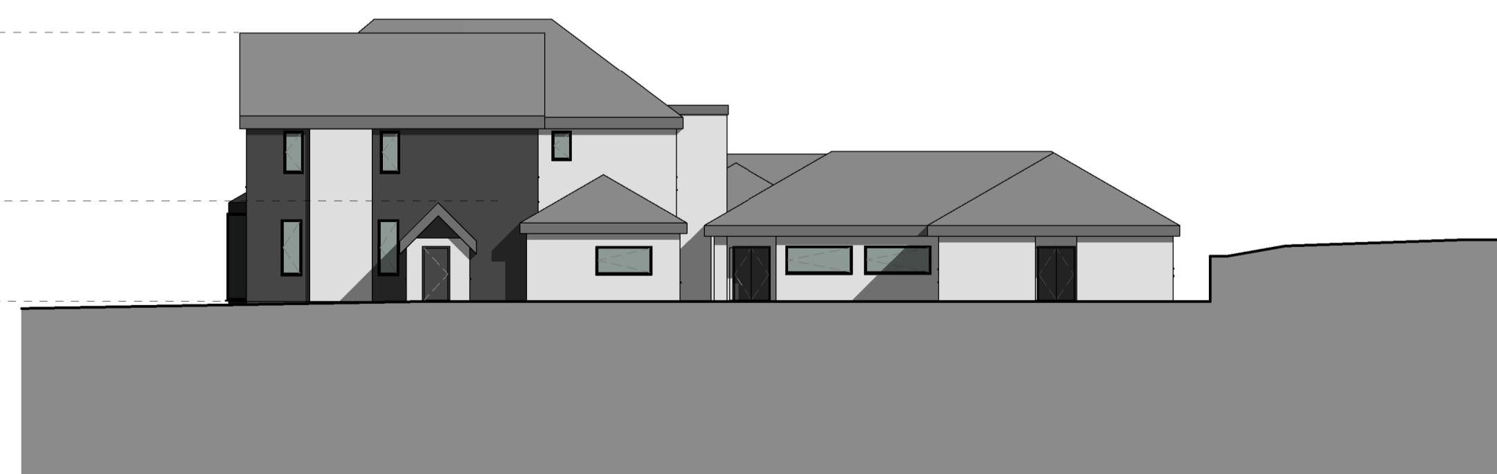
Existing East Elevation 1 : 200