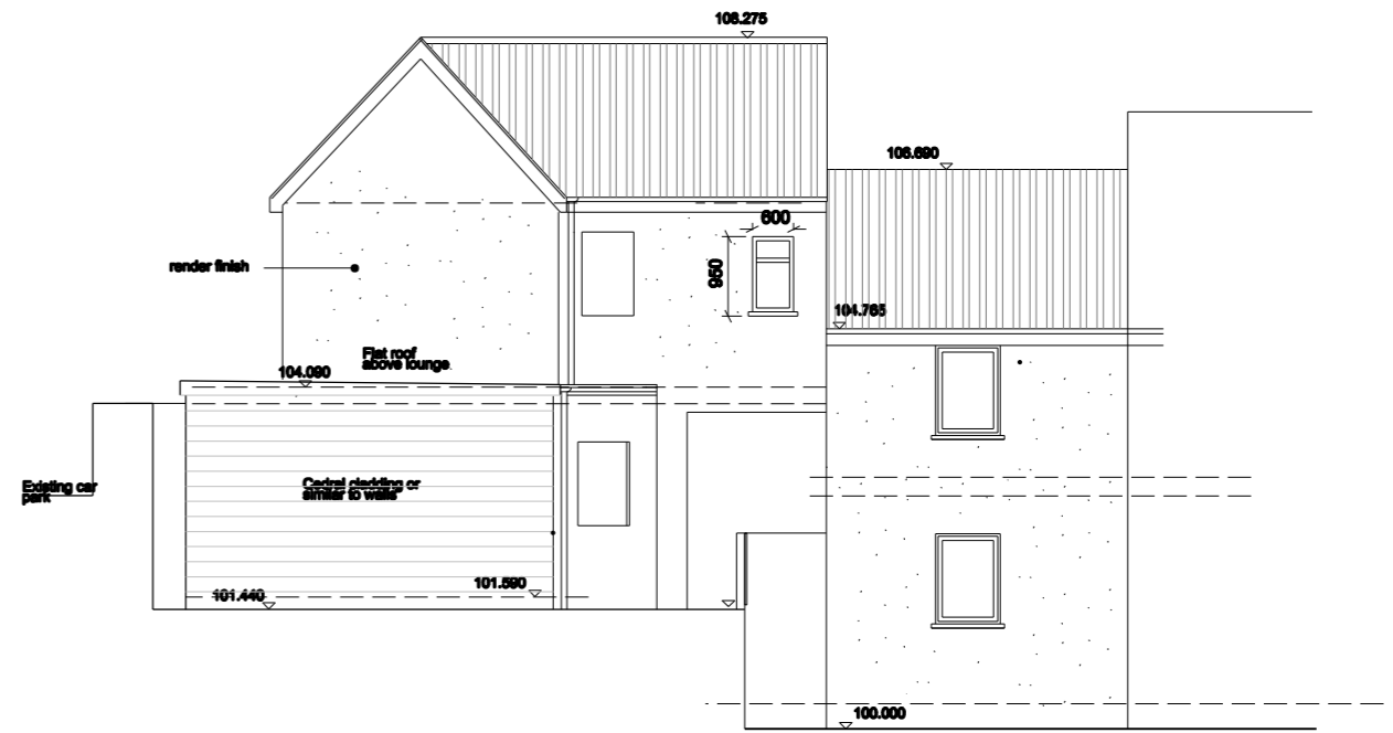
Proposed South East Elevation