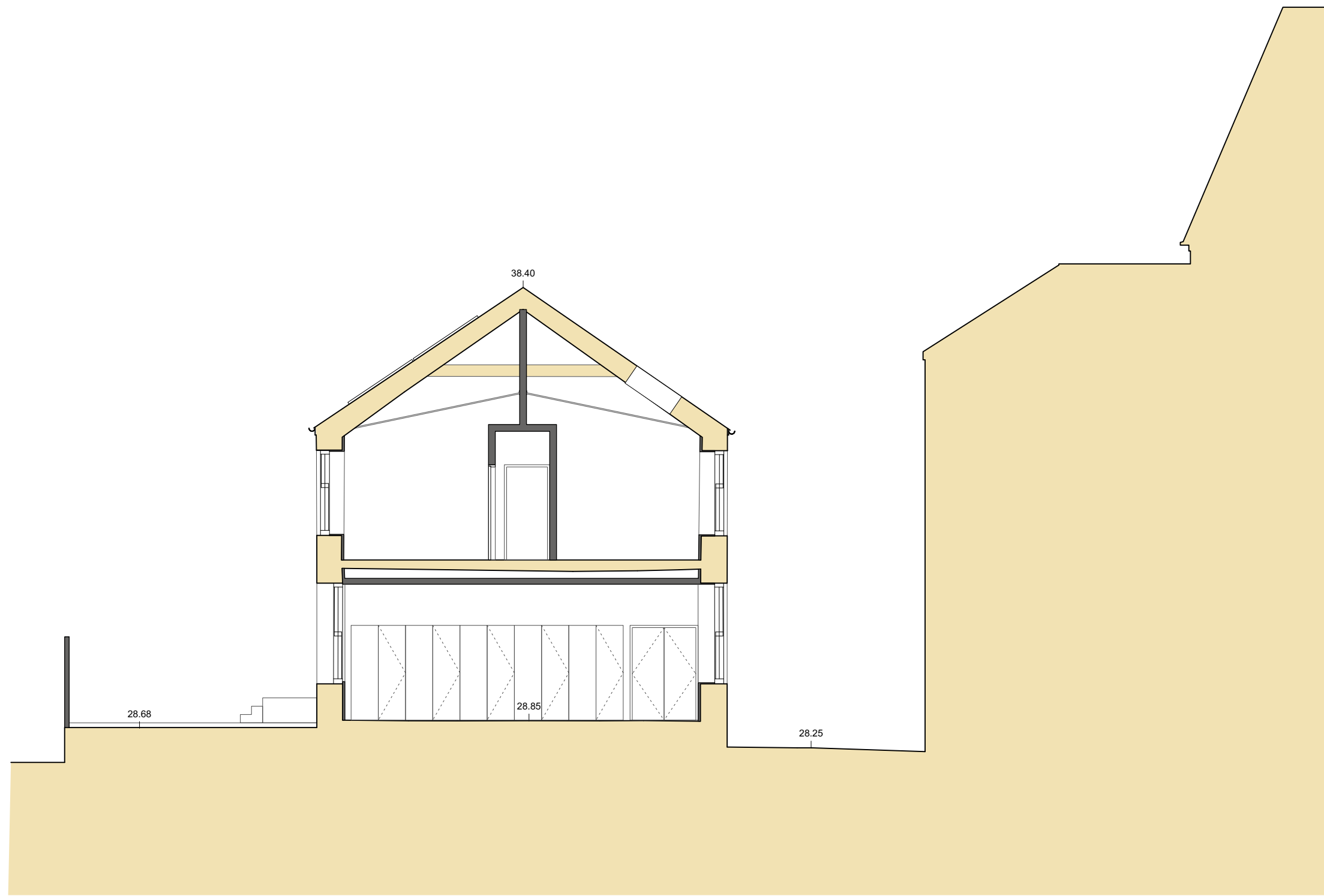
1 Cross section Scale: 1:100