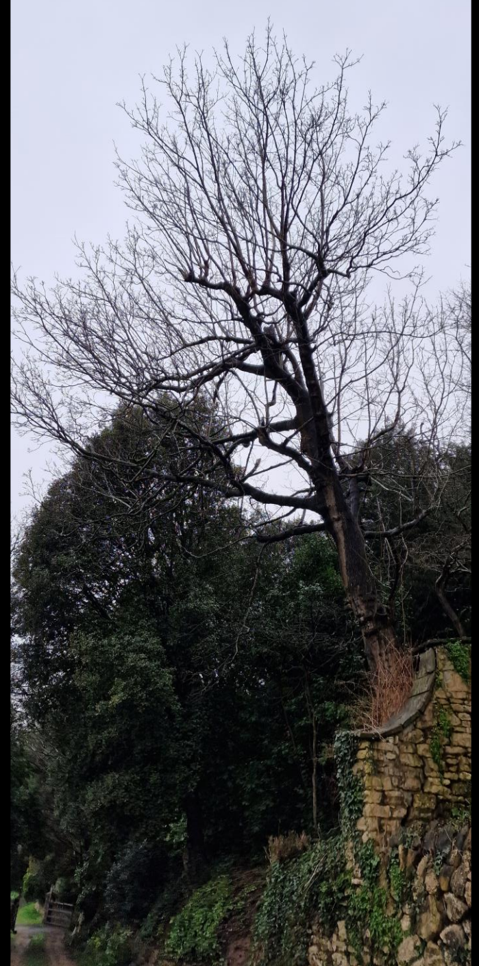
Pic 6 Field Maple G2 Crown reduction

Access the tree with climbing equipment and reduce the crown by 3m