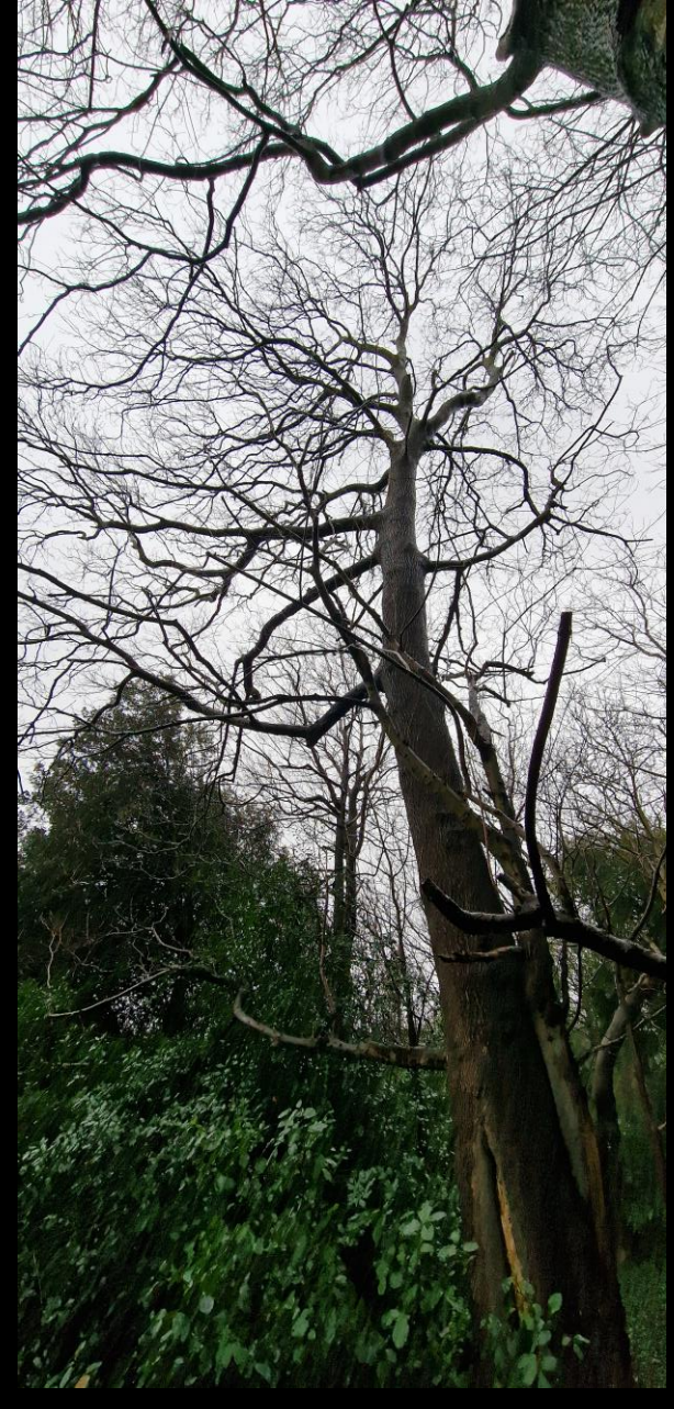
Pic 2 & 3 Norway Maple G19 – Crown reduction

Access the tree with climbing equipment and reduce from the top down with chainsaws