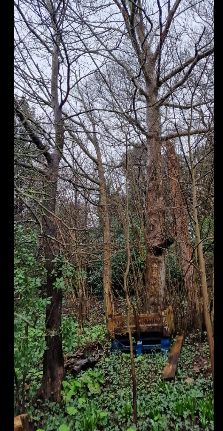
Pic 4 Sycamore T5 Crown reduction

Access the tree with climbing equipment and reduce the crown by 3m