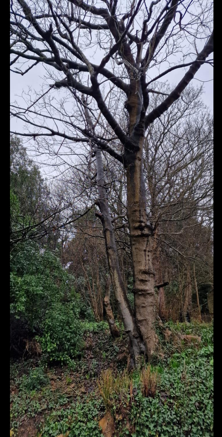
Pic 7 Field Maple G2 Removal of subsidiary limb

Access the tree with climbing equipment and reduce the crown by 3m