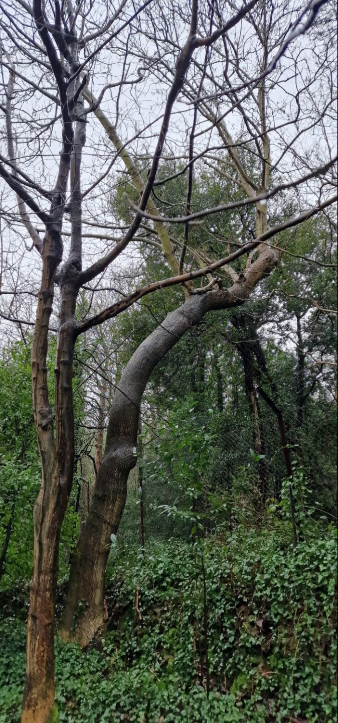
Pic 1 Ash T22 Hanging over Public footpath

Access the tree with climbing equipment and reduce from the top down with chainsaws