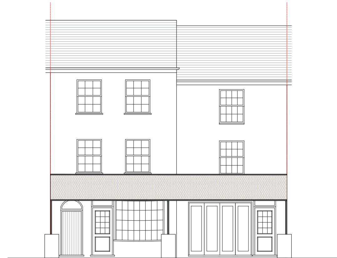
FRONT ELEVATION-SOUTH EAST