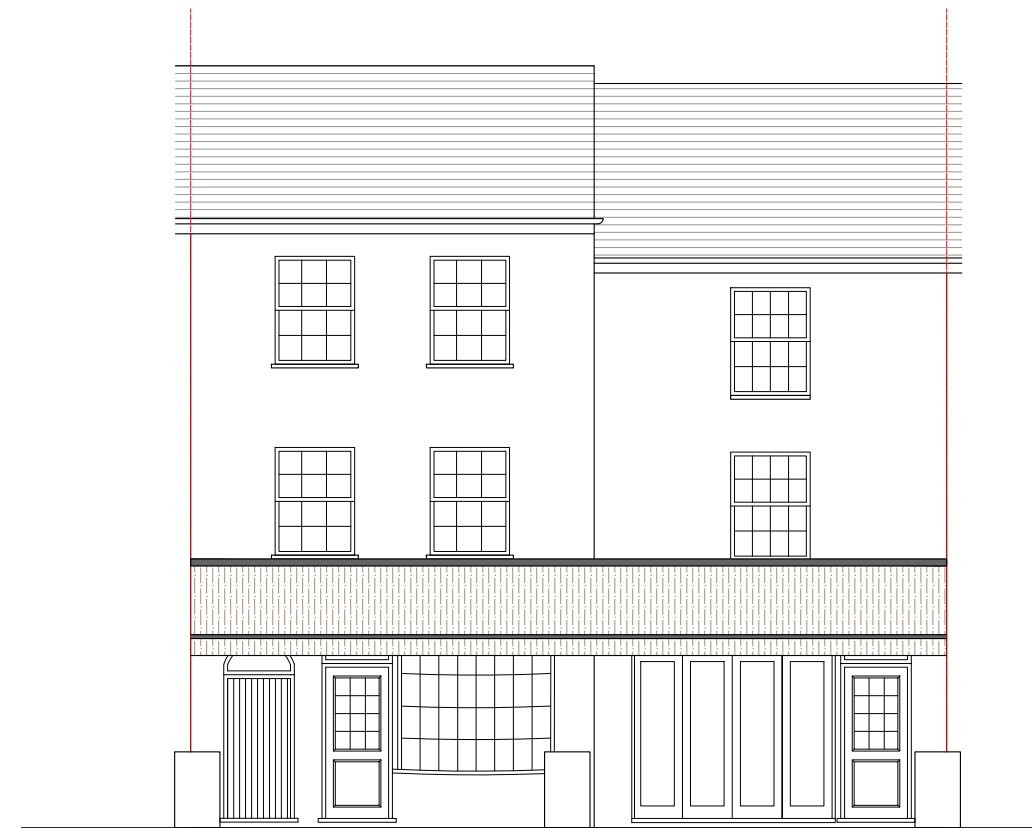
FRONT ELEVATION-SOUTH EAST