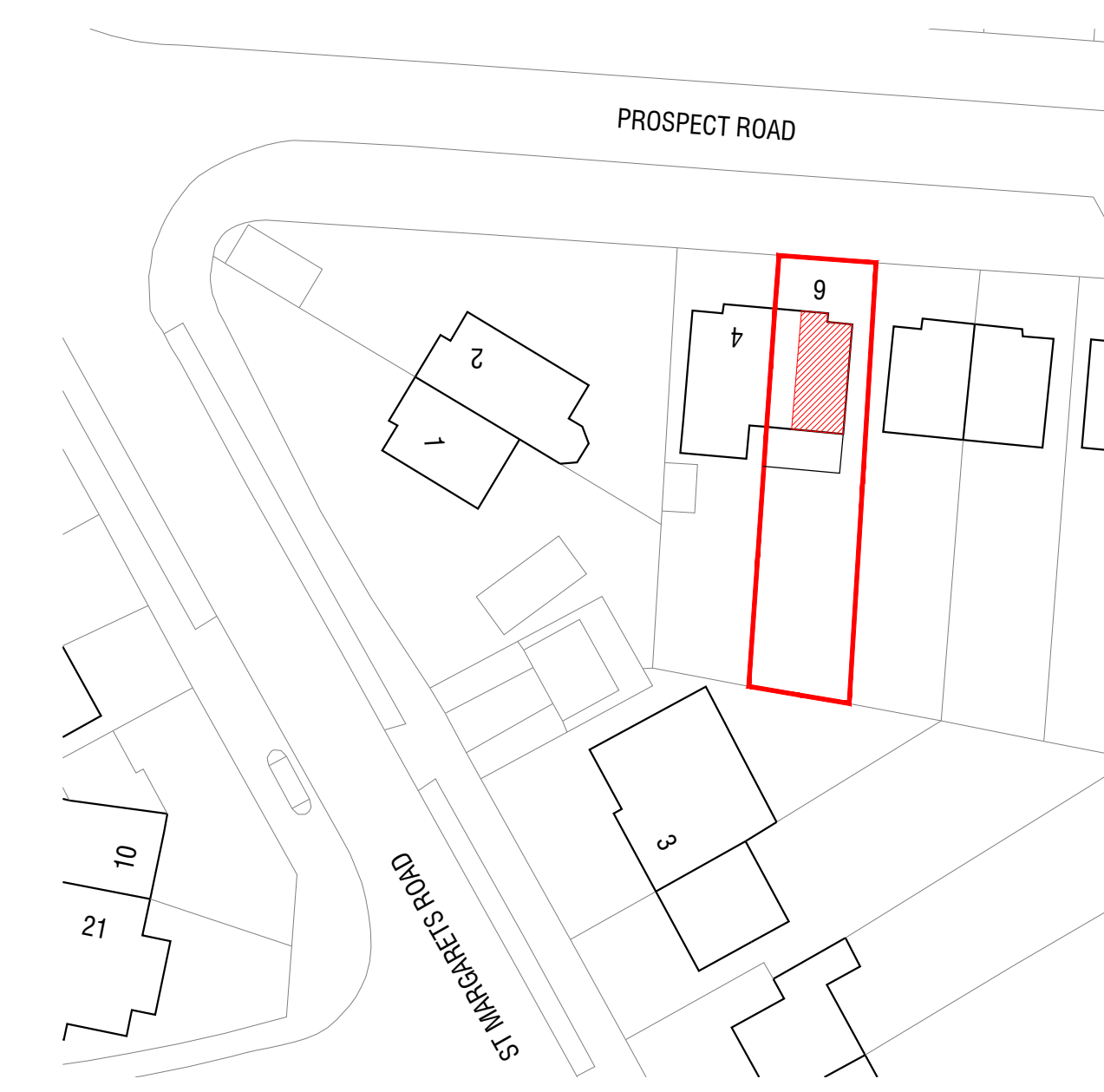
3 | SITE BLOCK PLAN 1:500 | A1