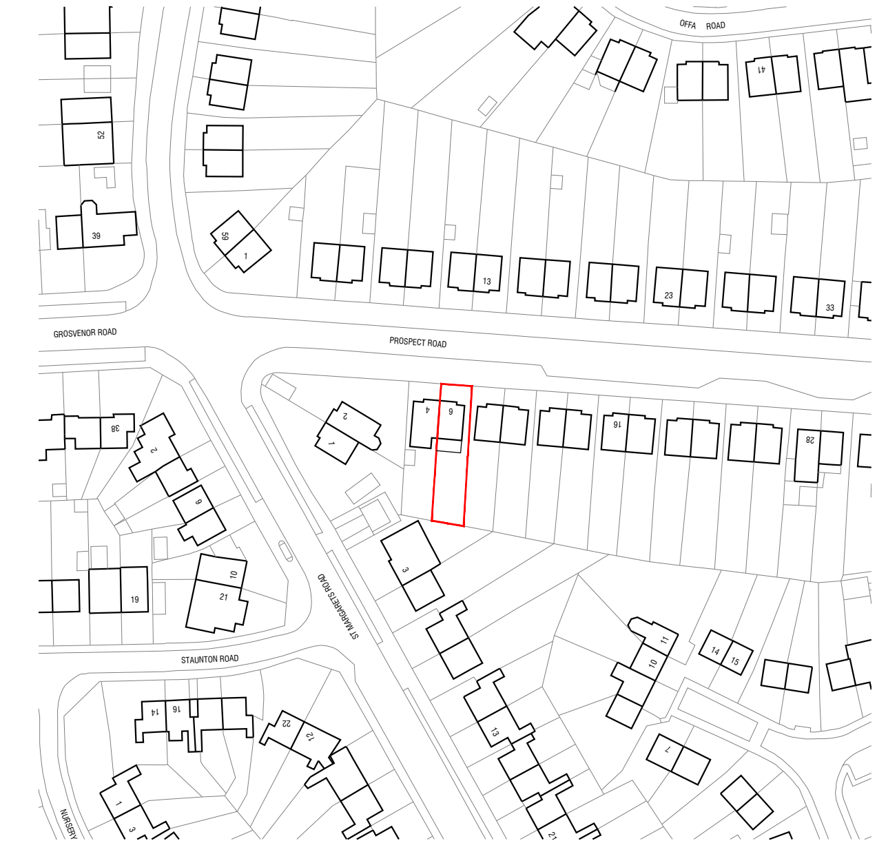
2 | SITE LOCATION PLAN 1:1250 | A1