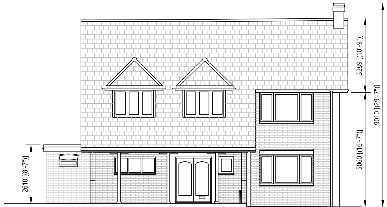
Elevation A 1 : 100