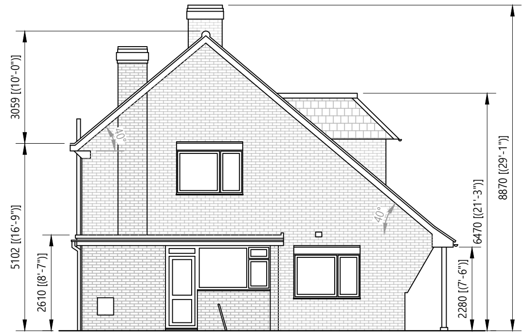
Elevation B 1 : 100