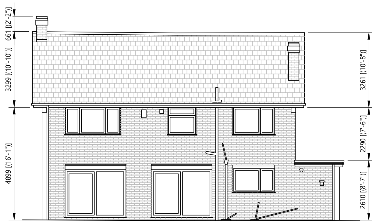
Elevation C 1 : 100