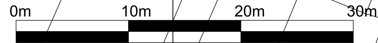
PROPOSED BLOCK PLAN Scale - 1:200 @ A1 / 1:400 @ A3