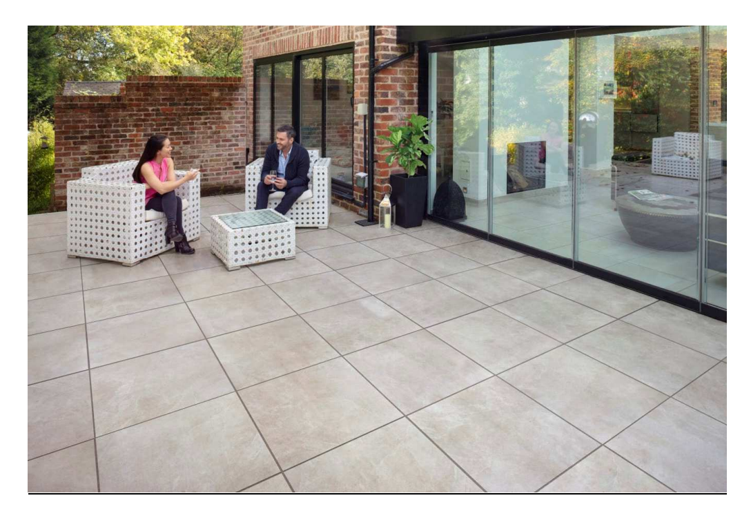
Marshalls Symphony Plus Natural Flag Paving in Colour 'Haze'