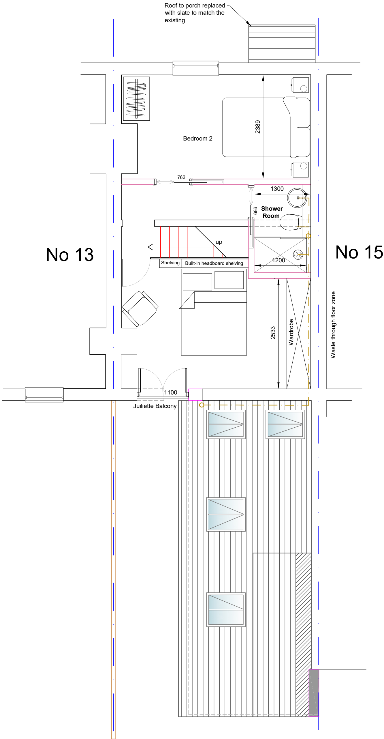
Proposed First Floor Plan Scale 1:50