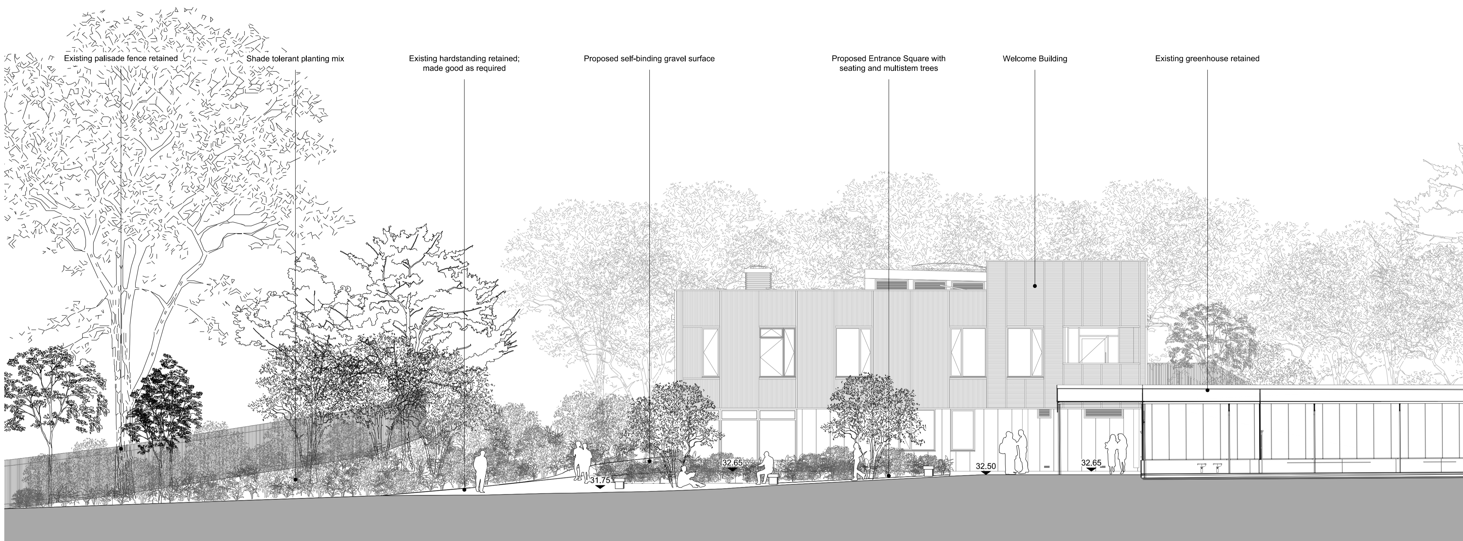
A-A' Proposed Section A-A' 1:100@A1