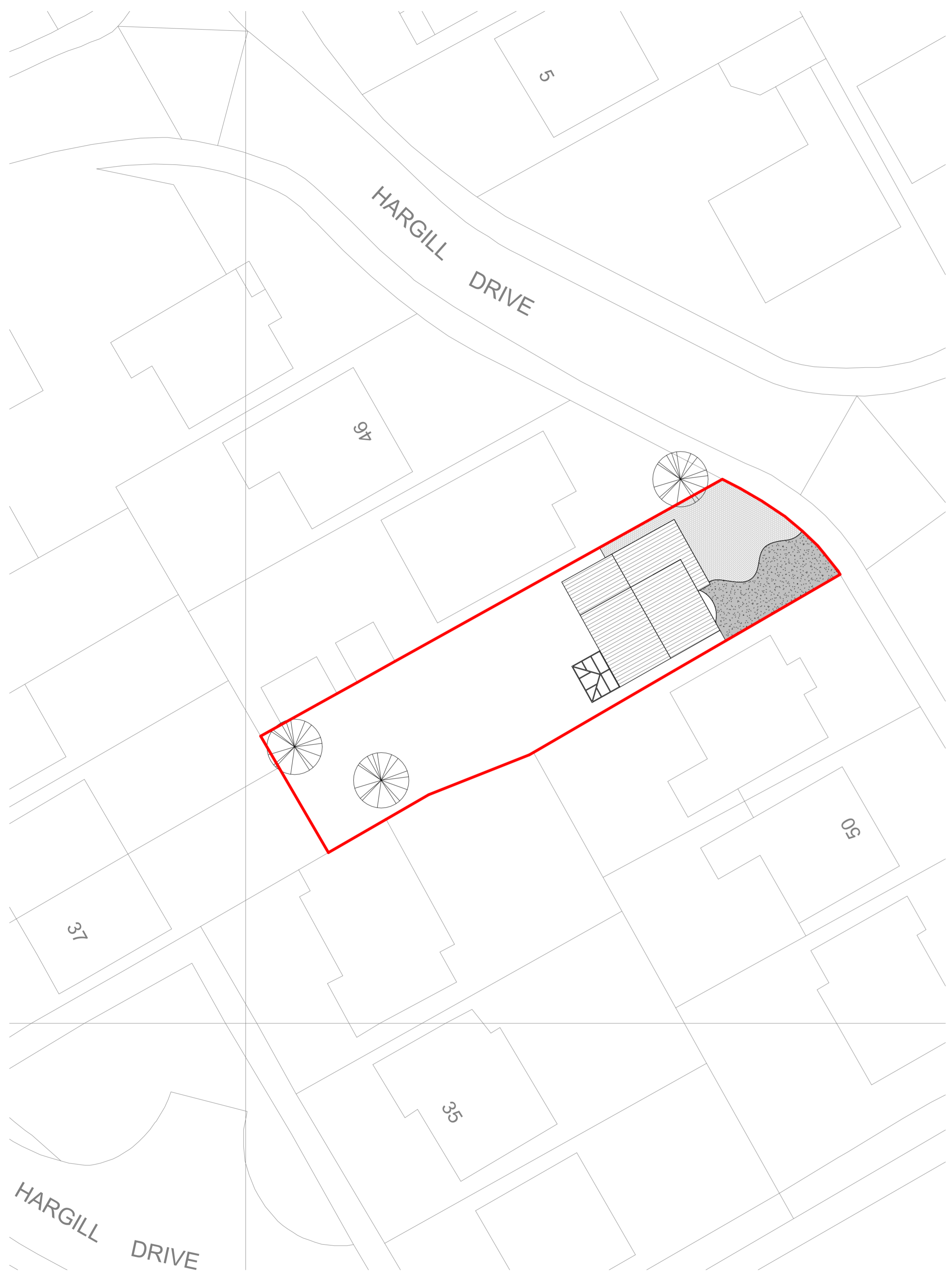
Existing Site Plan 1 : 200