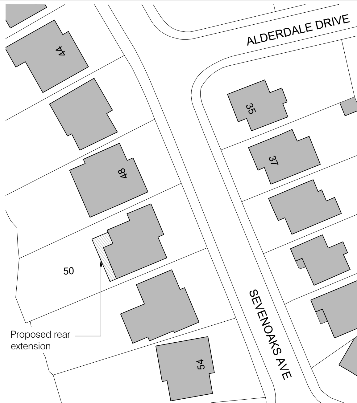
Proposed Block Plan - 1:500