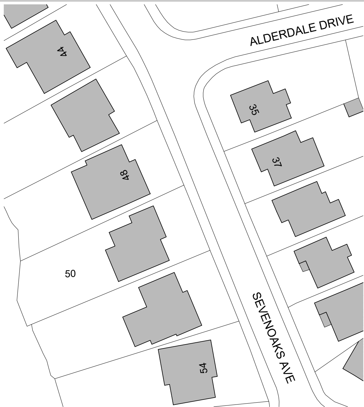
Existing Block Plan - 1:500