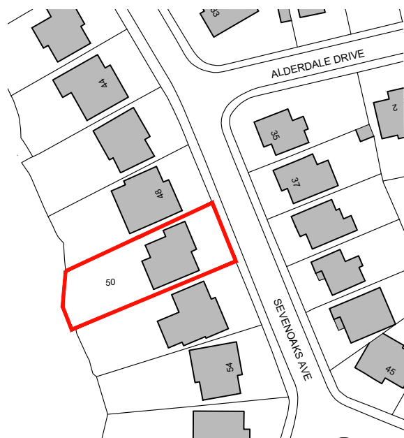
Location Plan - 1:1250