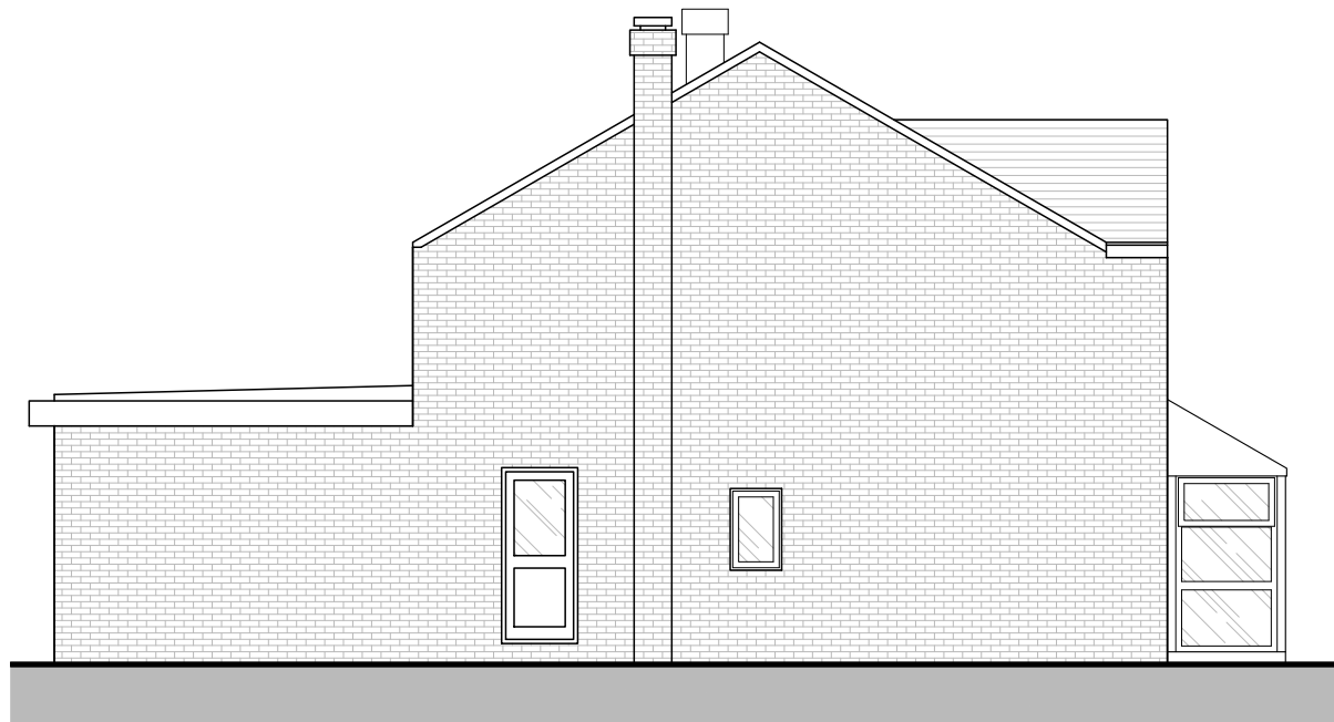
South Elevation - 1:100