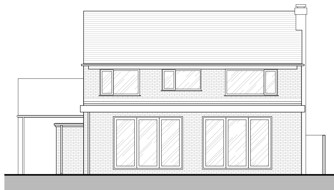
West Elevation - 1:100

Rev A - Central chimney stack removed - 24.02.24