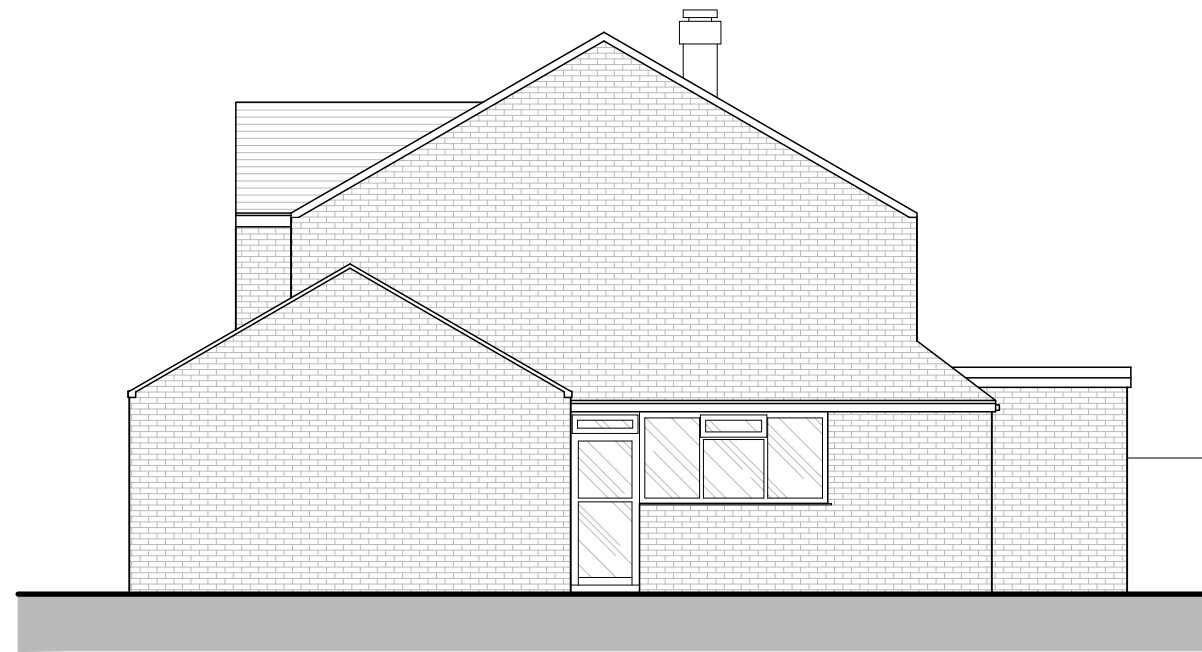
North Elevation - 1:100