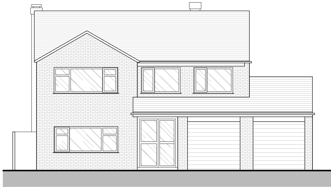
East Elevation - 1:100