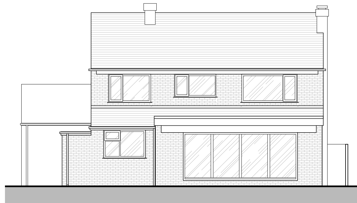
West Elevation - 1:100