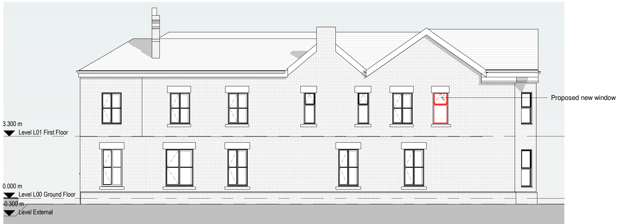
2 Proposed North Elevation 1 : 100