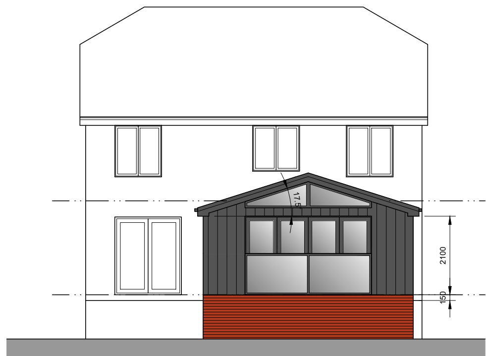
North Facing Rear Elevation