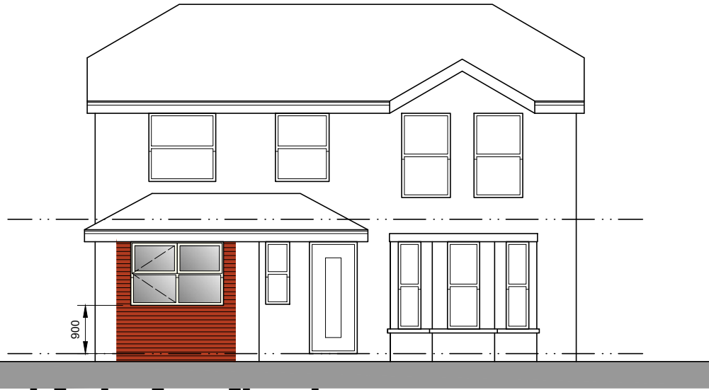
South Facing Front Elevation

Conway Architectural Design shall have no responsibility for any use made of this document other than for that which it was prepared and issued. This drawing should not be scaled. Work to figured dimensions only. All dimensions and levels to be checked on site. No building work is to be started until all relevant approvals are in place. Any discrepancies should be reported to Conway Architectural Design. This drawing should not be reproduced without written permission from Conway Architectural Design. Standard Building Regs Notes are to be provided by Conway Architectural Design prior to a building regs application being submitted.