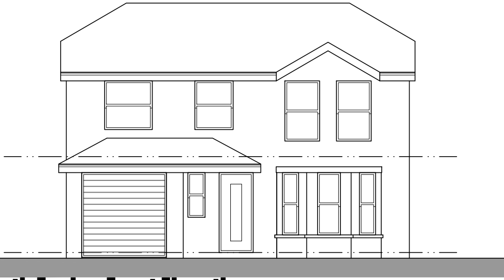
South Facing Front Elevation

Conway Architectural Design shall have no responsibility for any use made of this document other than for that which it was prepared and issued. This drawing should not be scaled. Work to figured dimensions only. All dimensions and levels to be checked on site. No building work is to be started until all relevant approvals are in place. Any discrepancies should be reported to Conway Architectural Design. This drawing should not be reproduced without written permission from Conway Architectural Design. Standard Building Regs Notes are to be provided by Conway Architectural Design prior to a building regs application being submitted.