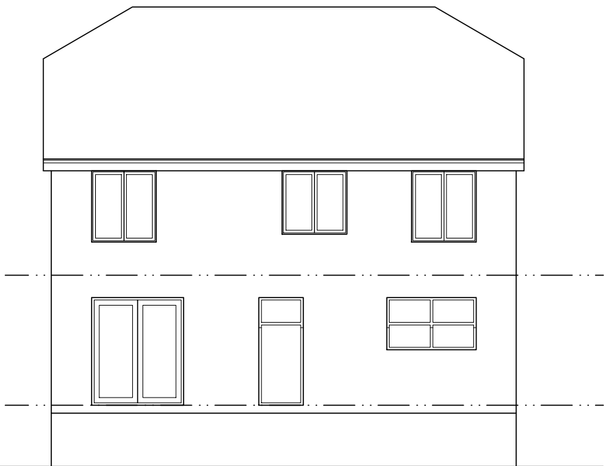
North Facing Rear Elevation