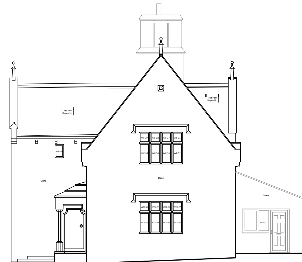
East Elevation as Existing