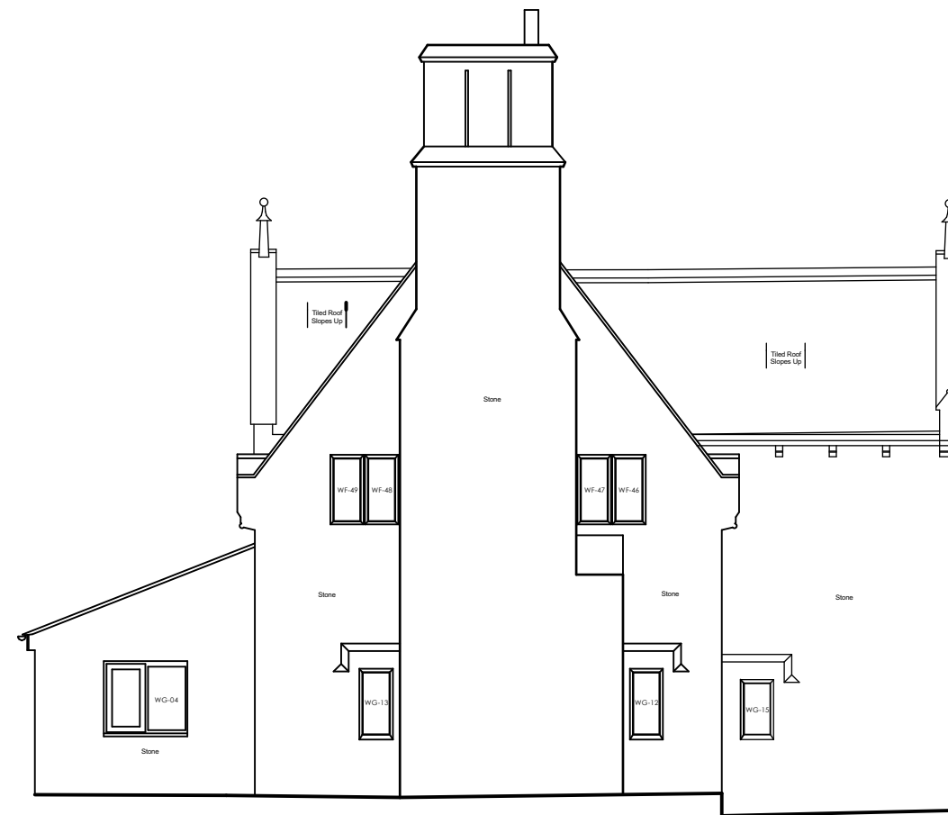
West Elevation as Existing