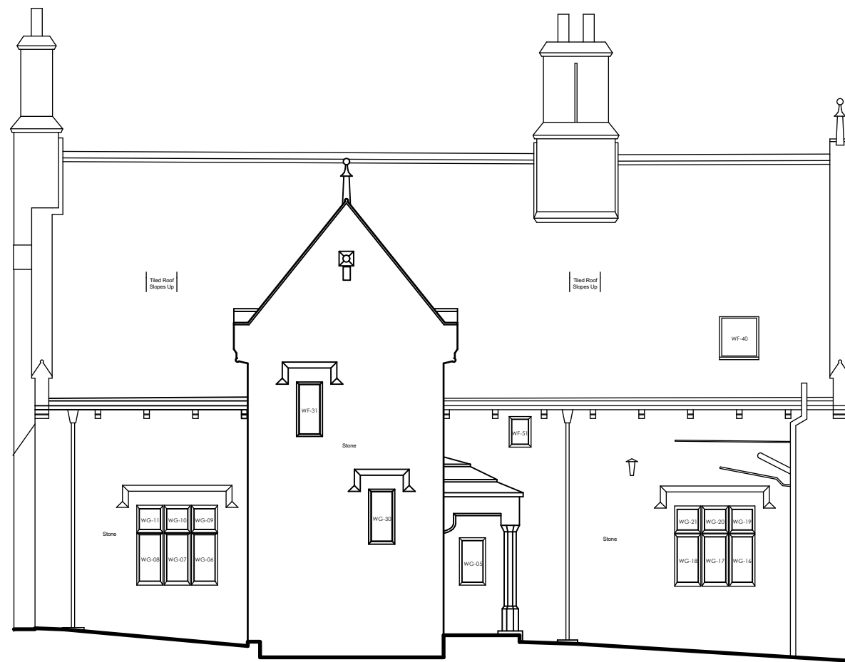
South Elevation as Existing