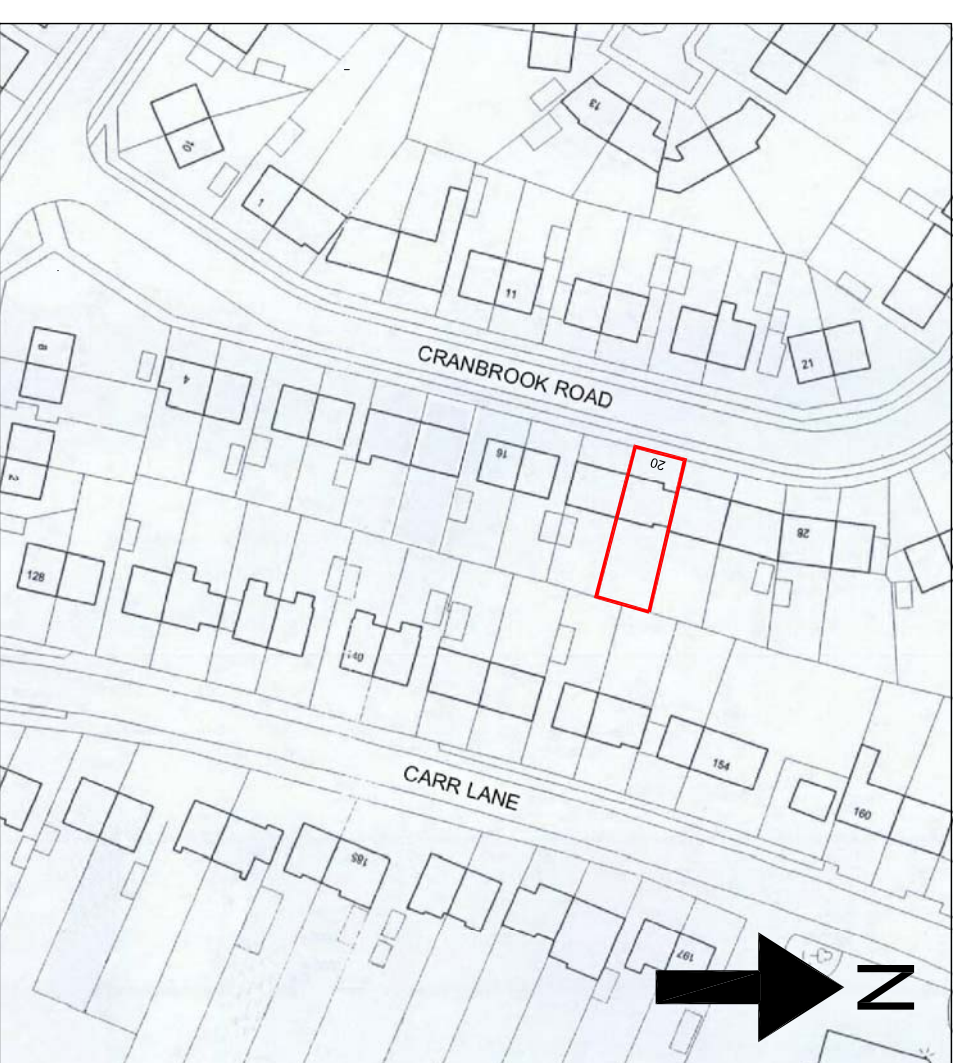
Location Plan (1:1250)