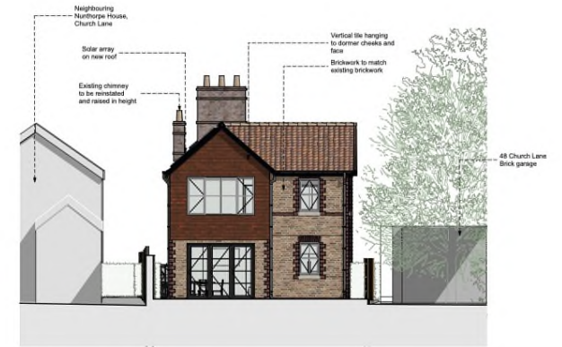
Proposed South East Elevation 1:100