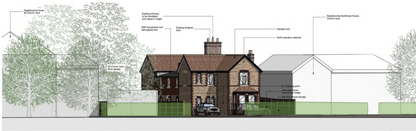
Proposed North East Elevation 1:100