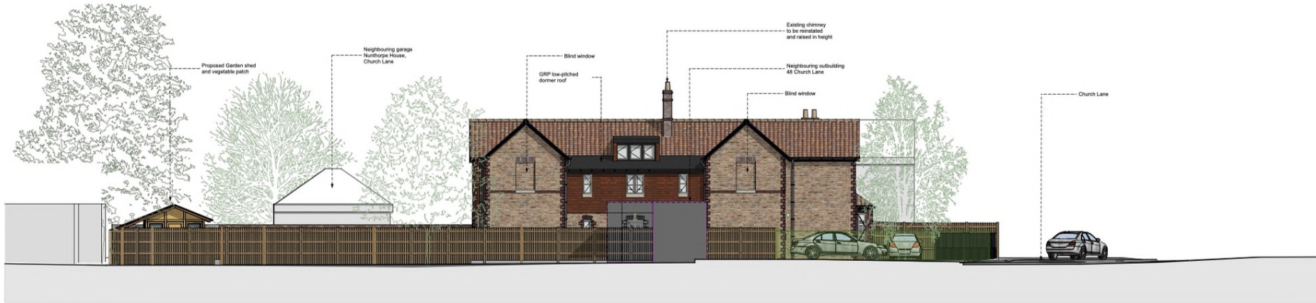
Proposed North East Elevation 1:100