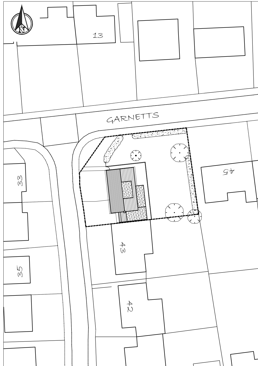
Existing Block Plan - 1:500