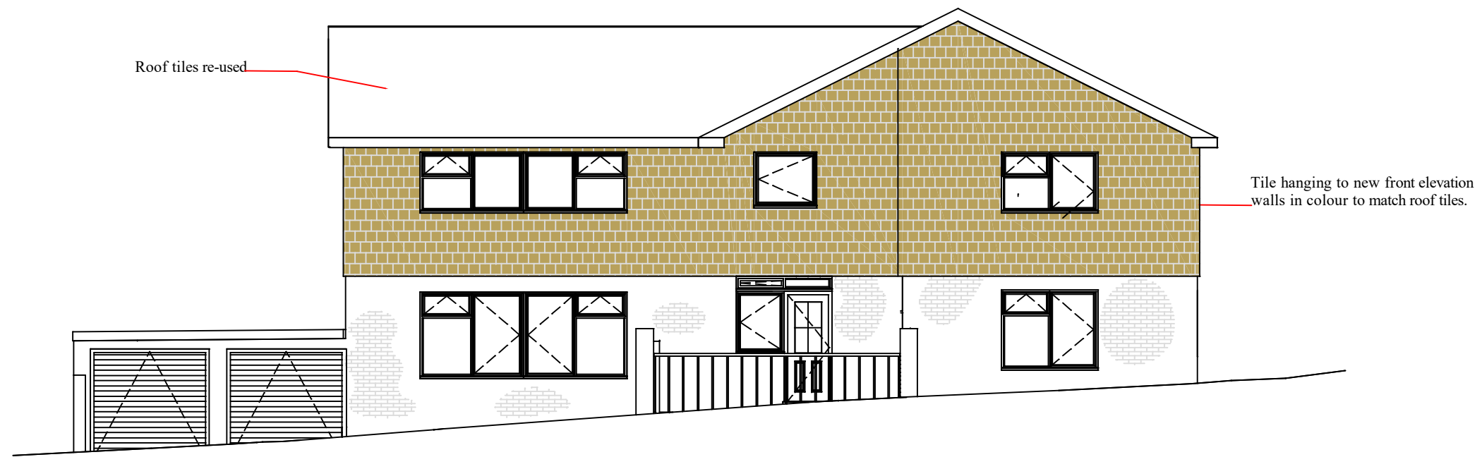
Front Elevation (South)