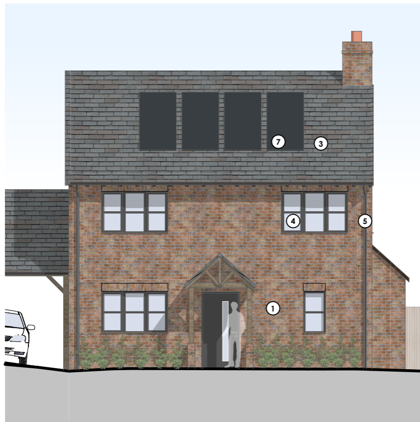
Plot 8 - Front (South/West) Elevation

This document and its design content is copyright © and is the property of T2 Architects. It may not be reproduced without their expressed permission. It shall be read in conjunction with all other associated project information including models, specifications, schedules and related consultants drawings and documentation. Do not scale from this drawing unless for Planning purposes. Figured dimensions only are to be used. All dimensions must be checked on site by the Contractor prior to the commencement of any fabrication or building works. Immediately report any discrepancies, errors or omissions to T2 Architects prior to the commencement of any fabrication or building works. If in doubt please ASK.