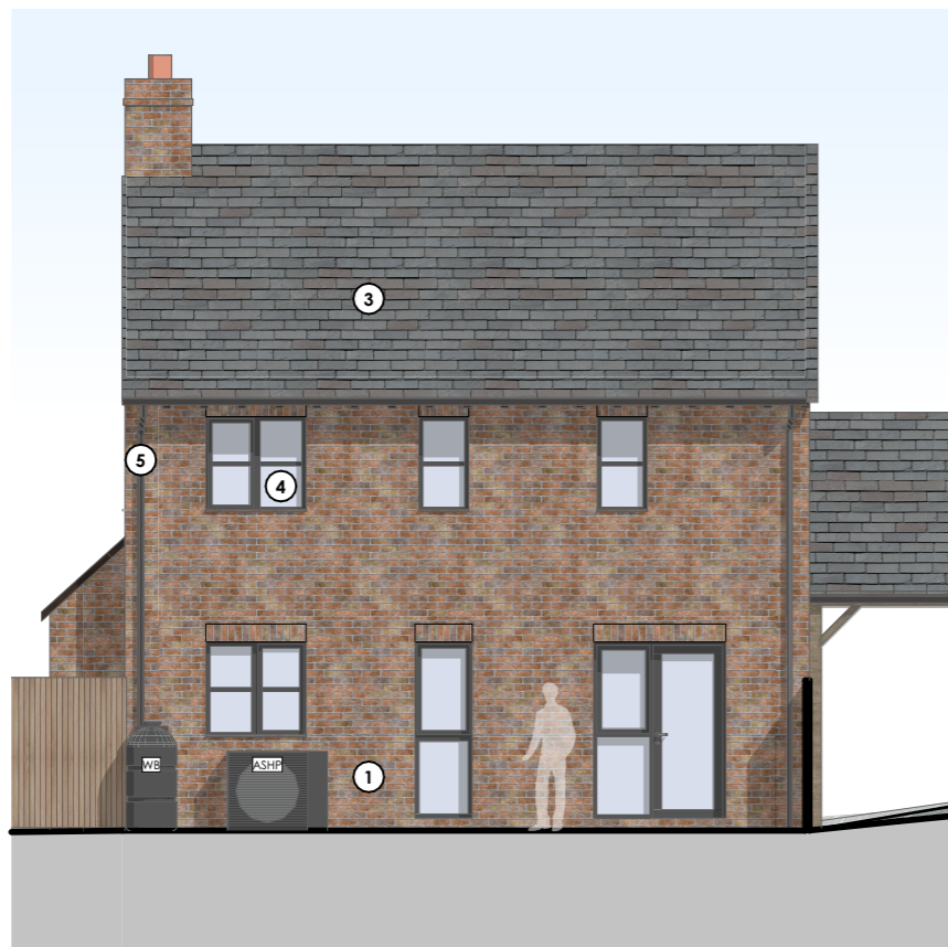
Plot 8 - Rear (North/East) Elevation