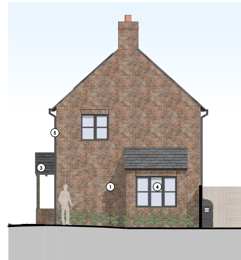
Plot 8 - Side (South/East) Elevation