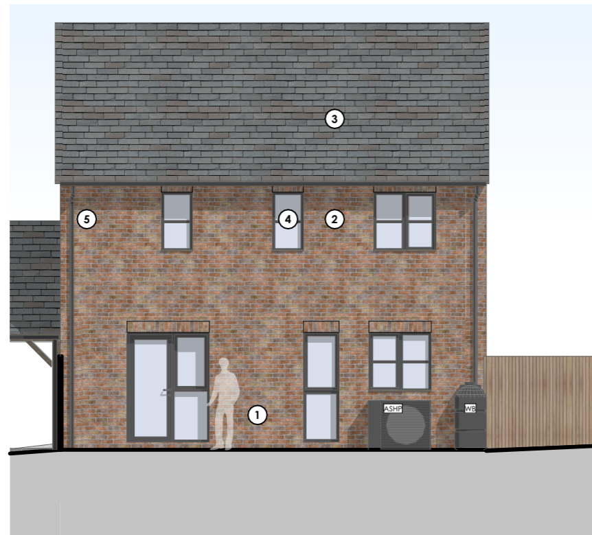
Plot 7 - Rear (North/East) Elevation