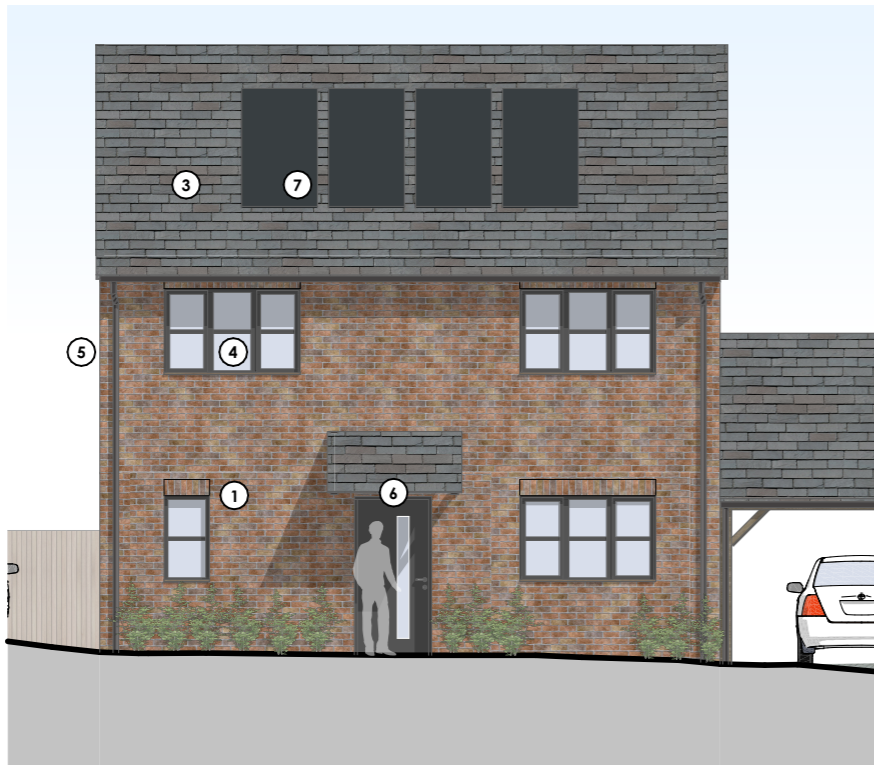
Plot 7 - Front (South/West) Elevation