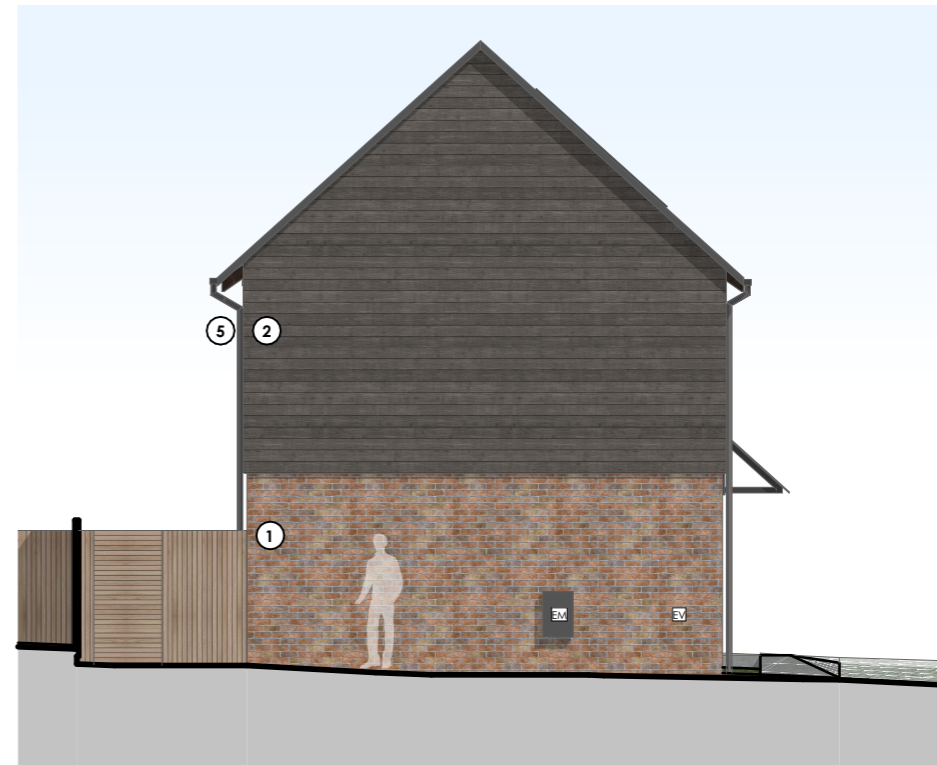
Plot 3 - Side (South/West) Elevation