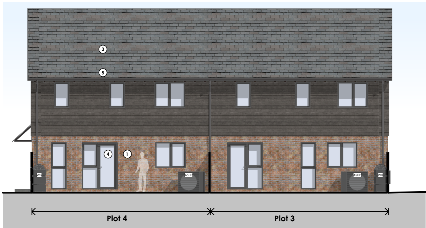
Rear (North/West) Elevation