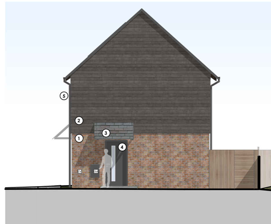
Plot 4 - Side (North/East) Elevation