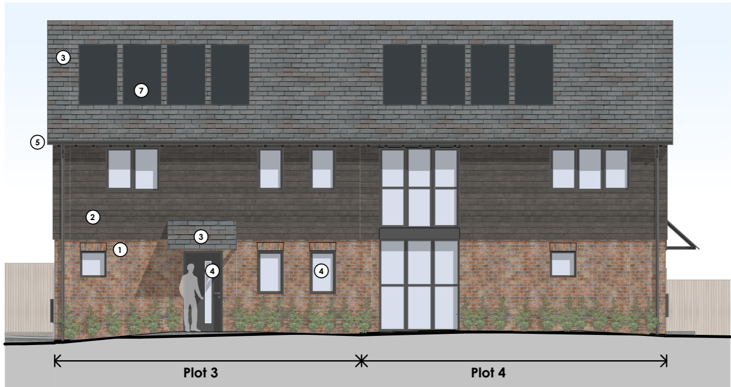
Front (South/East) Elevation