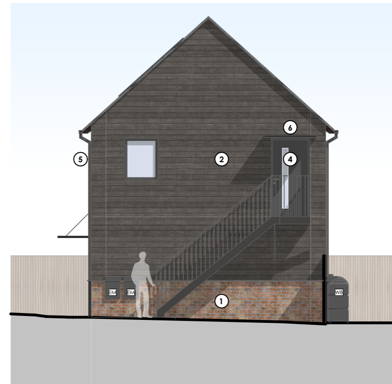
Plots 5/6 - Side (South/East) Elevation