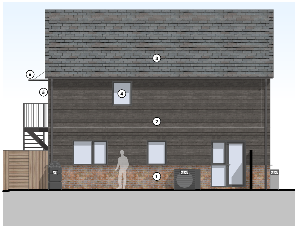
Plots 5/6 - Rear (North/East) Elevation