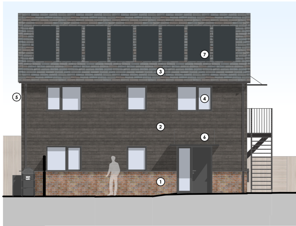
Plots 5/6 - Front (South/West) Elevation