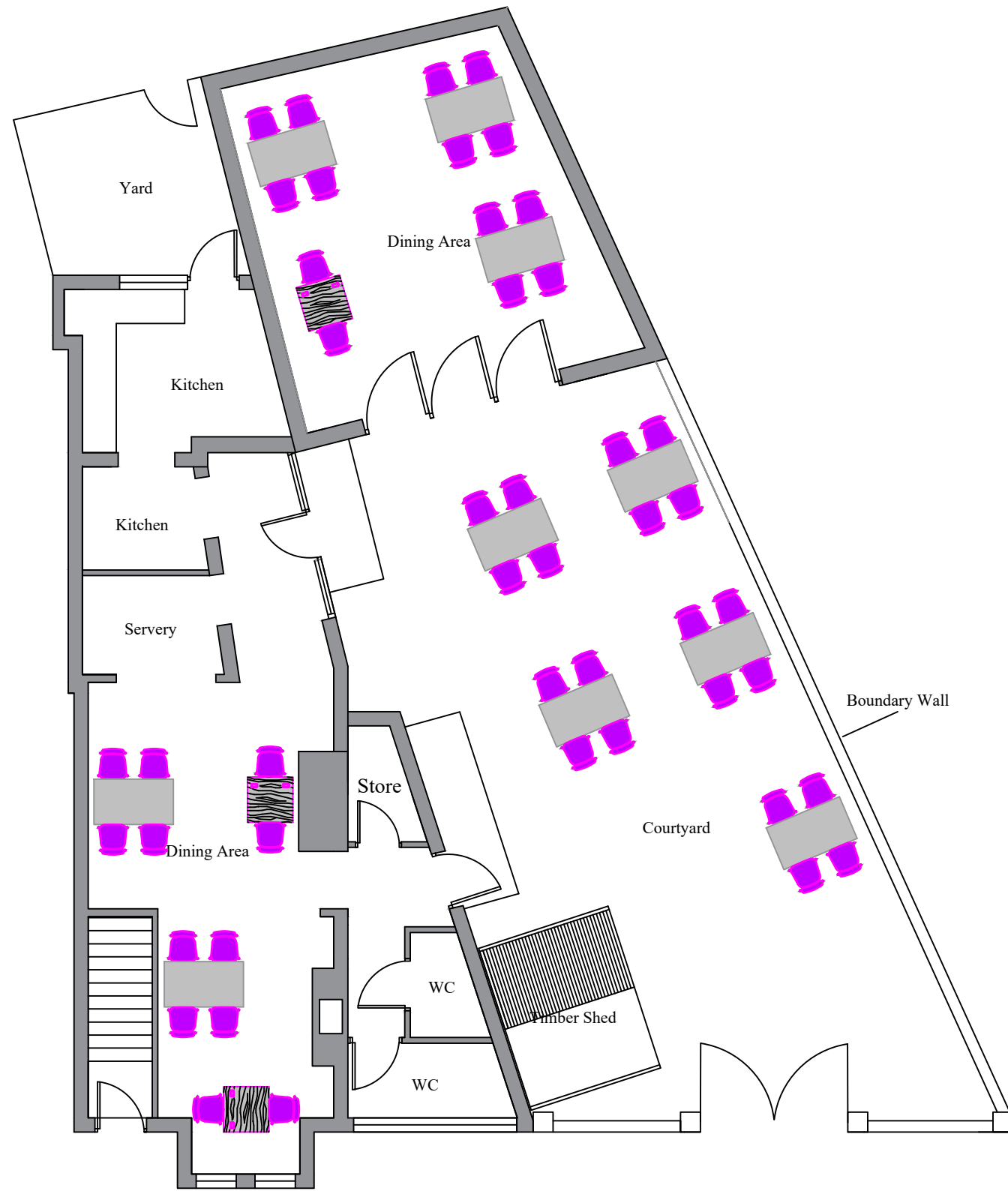
PROPOSED GROUND FLOOR LAYOUT PLAN