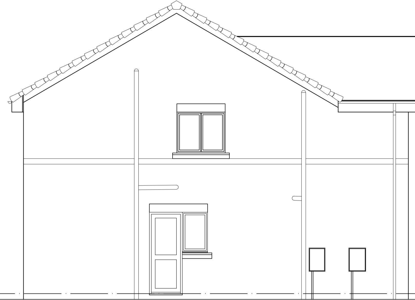
EXISTING GABLE ELEVATION