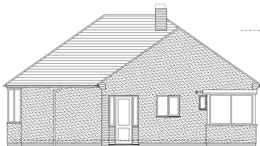
SIDE ELEVATION (east)