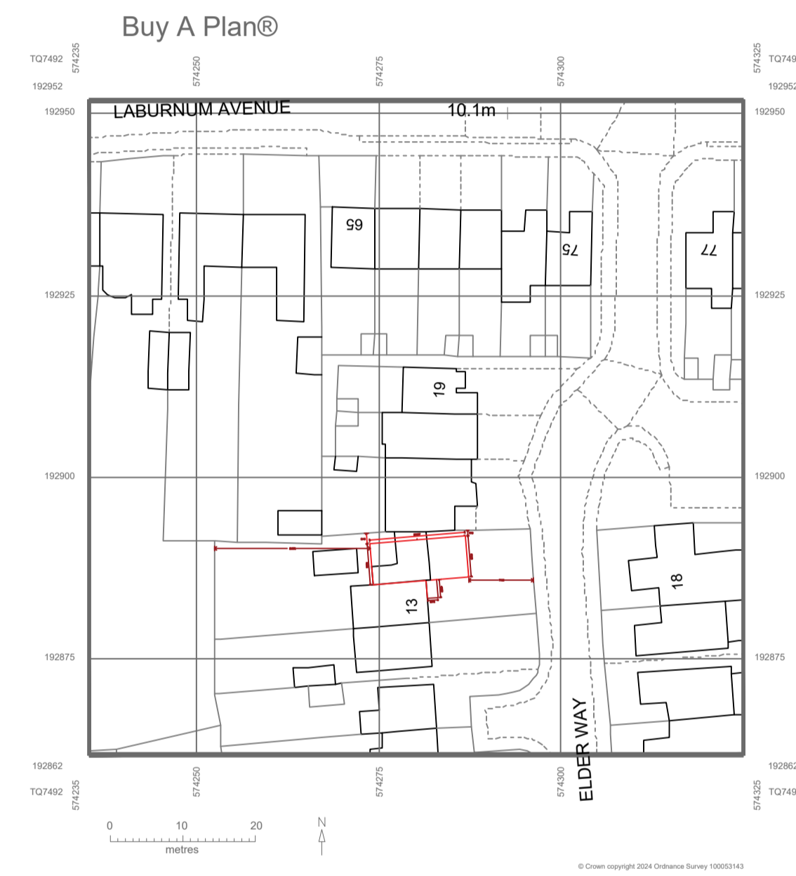
Proposed Block Plan (1:1)