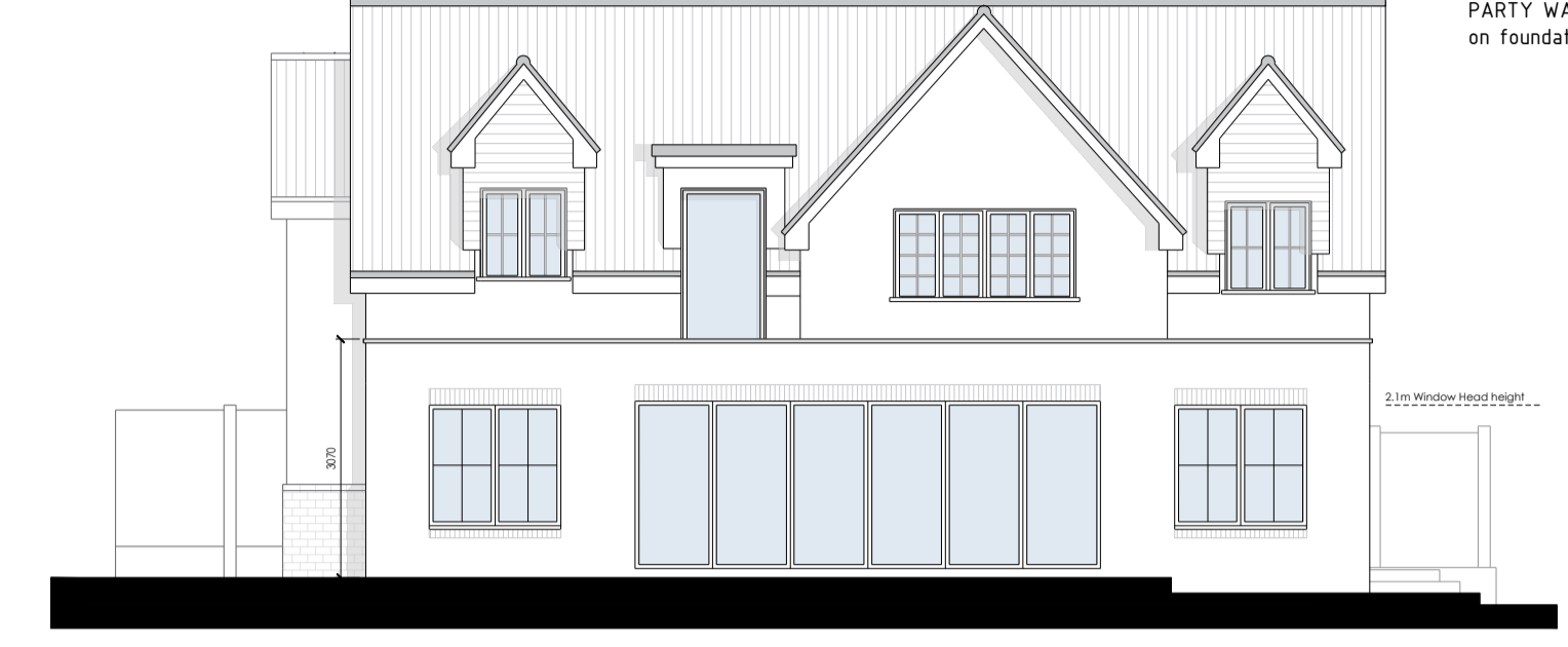
Proposed Rear Elevation 0 1m 2 3 scale bar