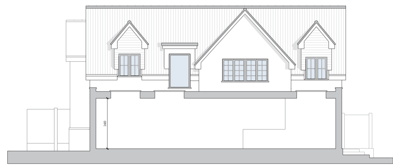
Proposed Section 0 1m 2 3 scale bar