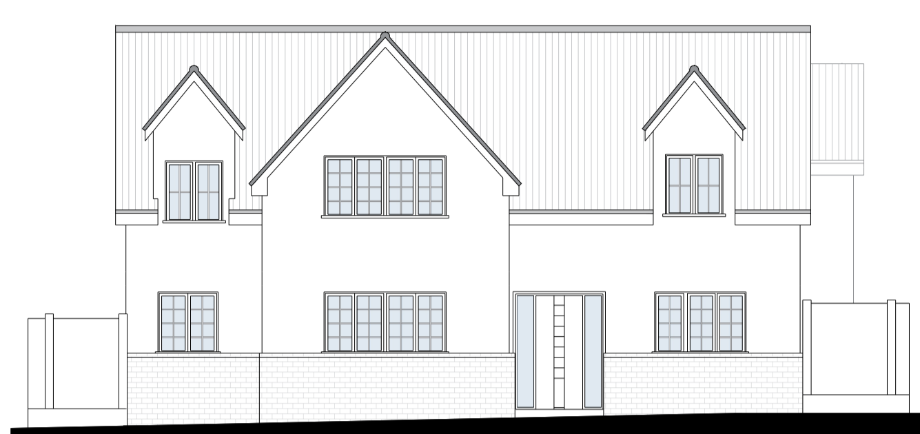
Proposed Front Elevation 0 1m 2 3 scale bar

General notes: All work to comply with current British Standards, Building Regulation and codes of practice. NO responsibility can be taken if dimensions are scaled from this drawing. Building Regulation Approval to be PASSED before any work commence on site. All Structural members to have Full Structural Calculation to satisfy Local Authority. Any Variations or on site amendments to be cleared by client This Drawing is to be read in conjunction with all other relevant documents All dimensions are to be confirmed on site before commencement of work by the nominated Contractor PARTY WALLS NOTICES to be served and agreed before any work on foundations are taken place.