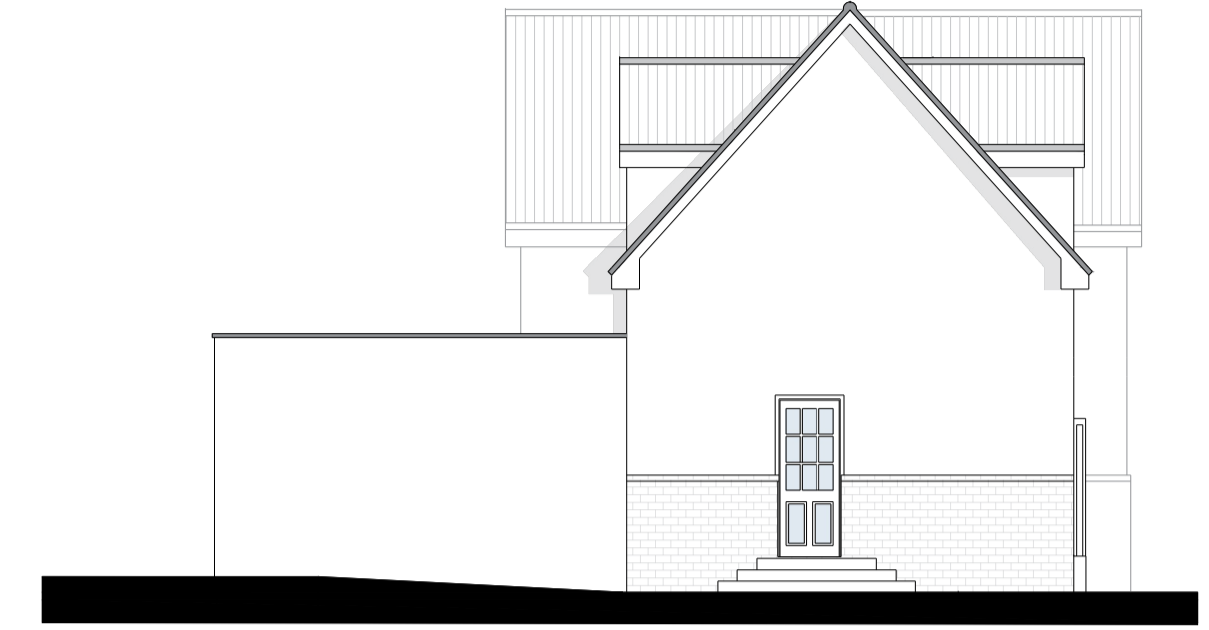
Proposed Flank Elevation 0 1m 2 3 scale bar