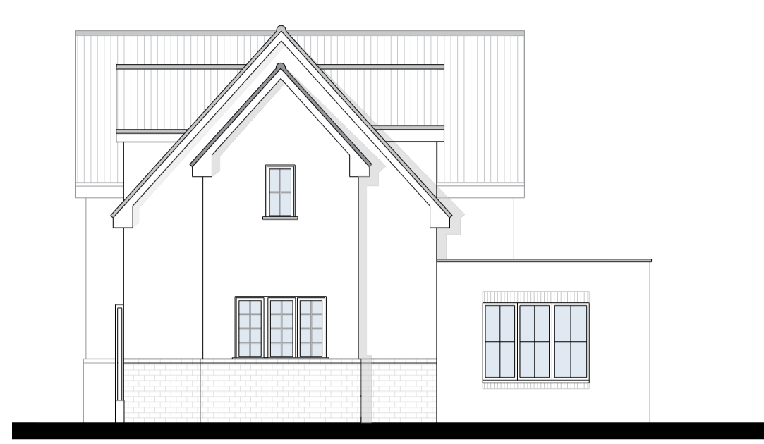
Proposed Flank Elevation 0 1m 2 3 scale bar