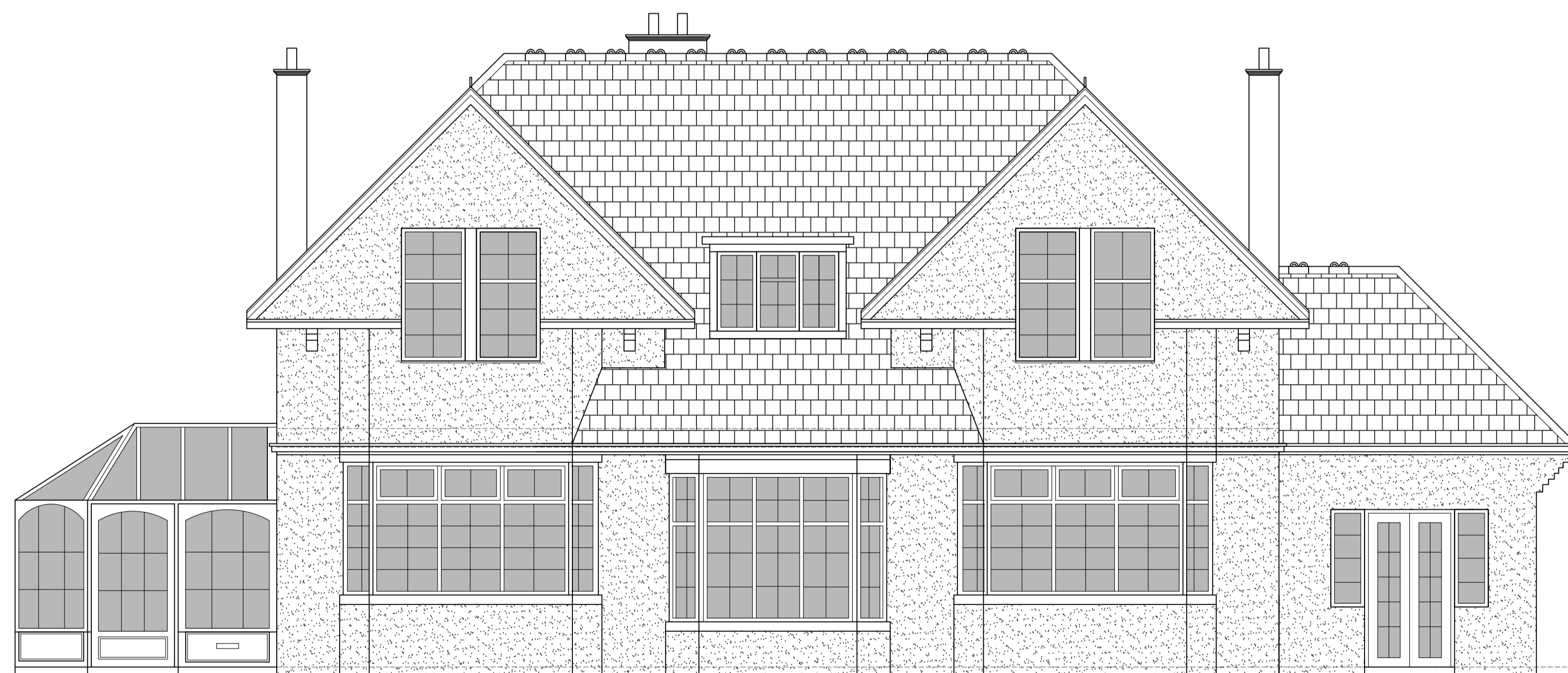
EXISTING | FRONT ELEVATION 1:50