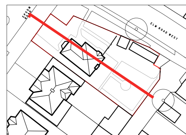
EXISTING SECTION THROUGH EXISTING HOUSE :