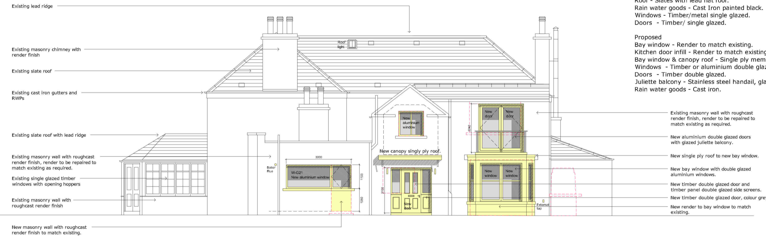
PROPOSED NORTH EAST ELEVATION

Note windows and door frames on this elevation to be grey, all other windows/door frames to be white.