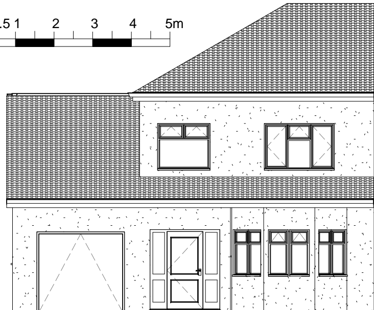
4 Front 1 : 100