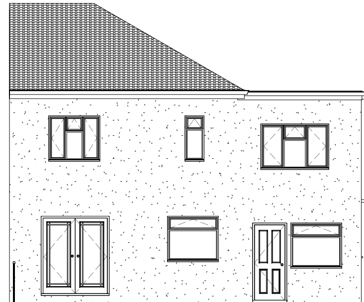
3 Rear 1 : 100