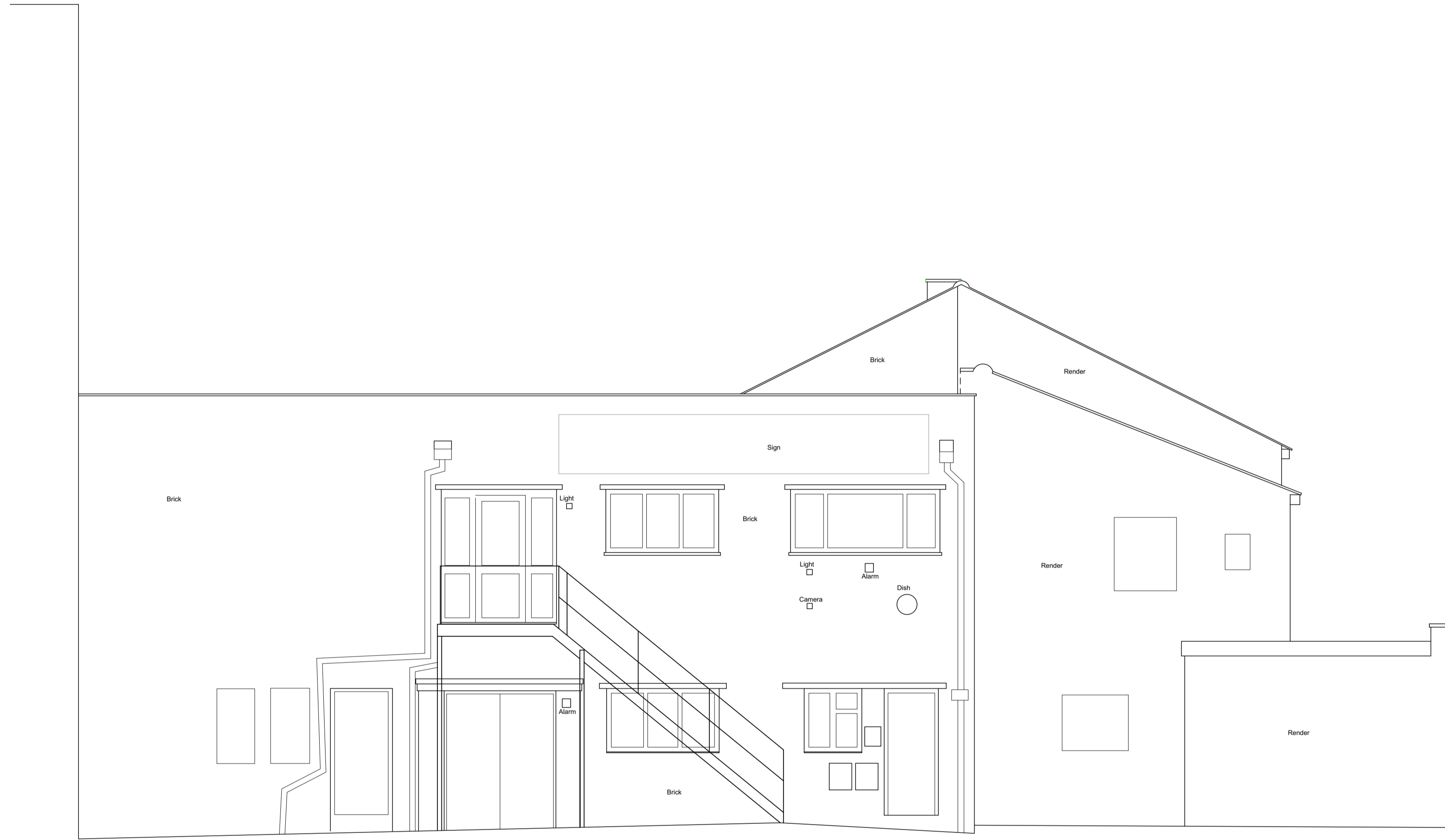
A Existing East Elevation EE.03 1:50@A1, 1:100@A3