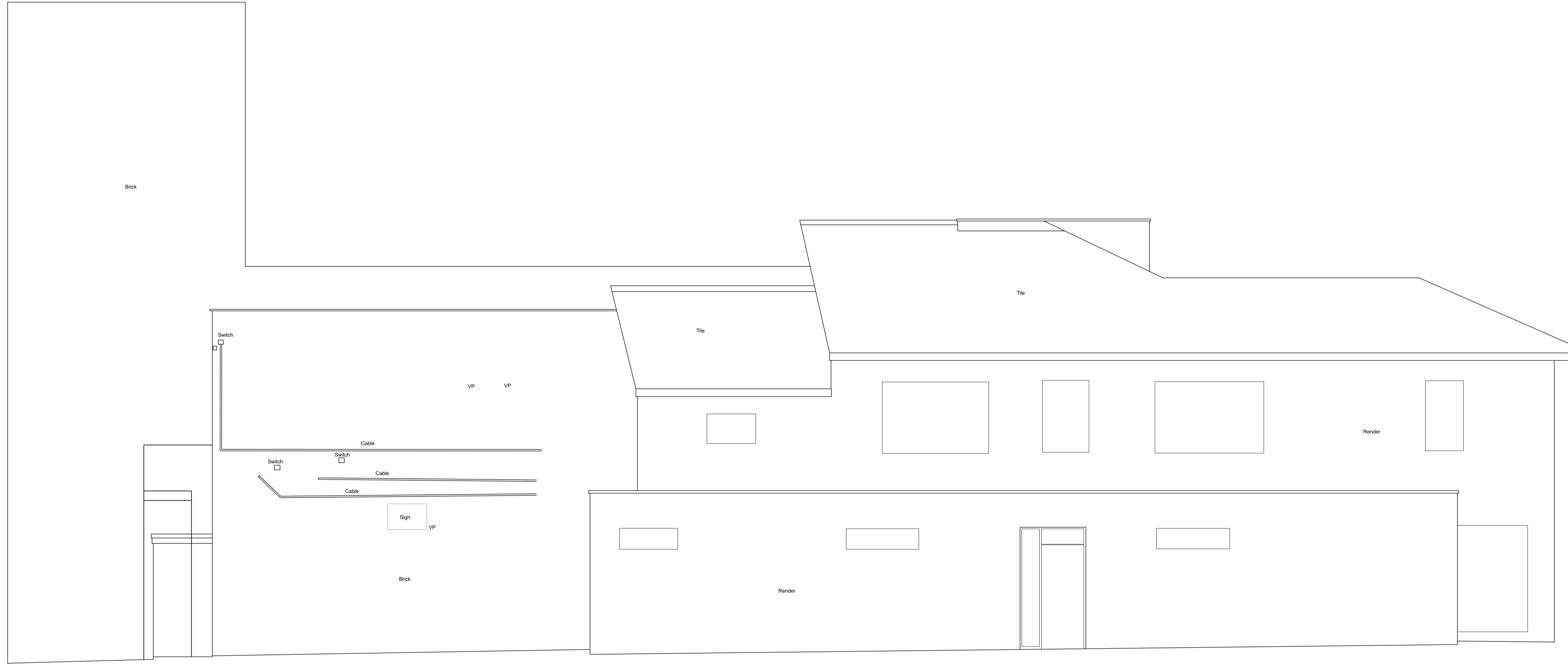
A Existing North Elevation EE.02 1:50@A1, 1:100@A3