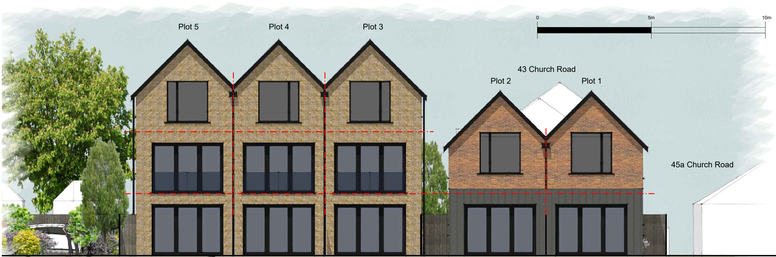
Plots 1-5 Rear Elevation