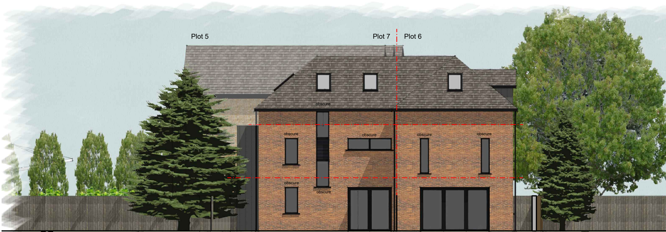
Plot 6-7 Rear Elevation