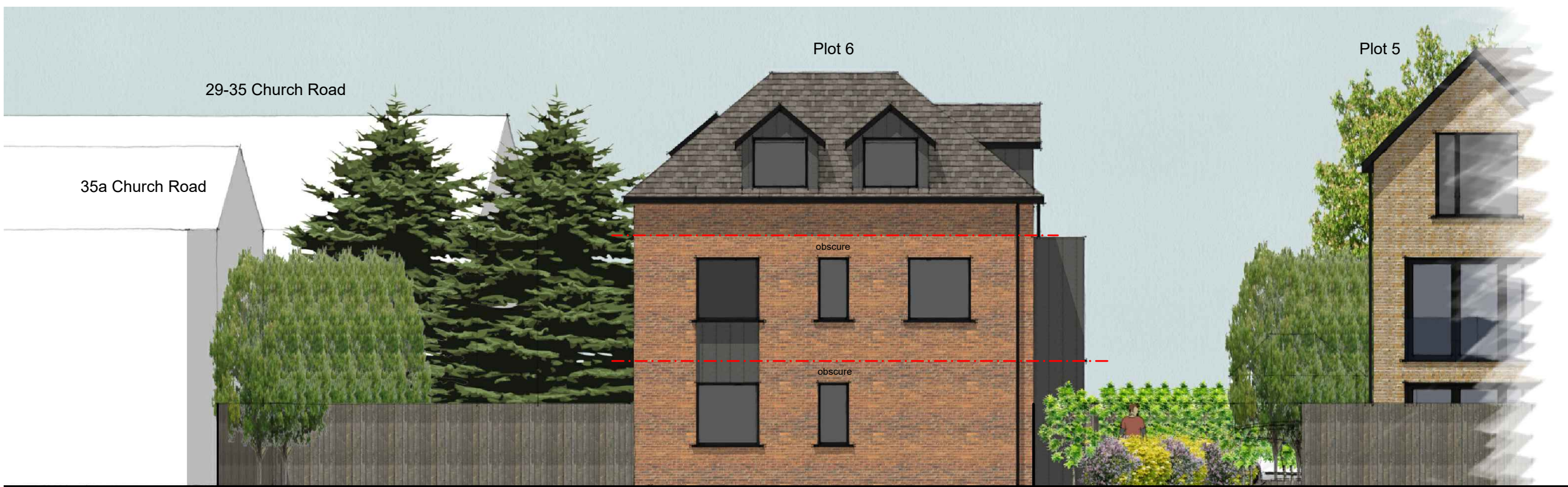
Plot 6 Side Elevation