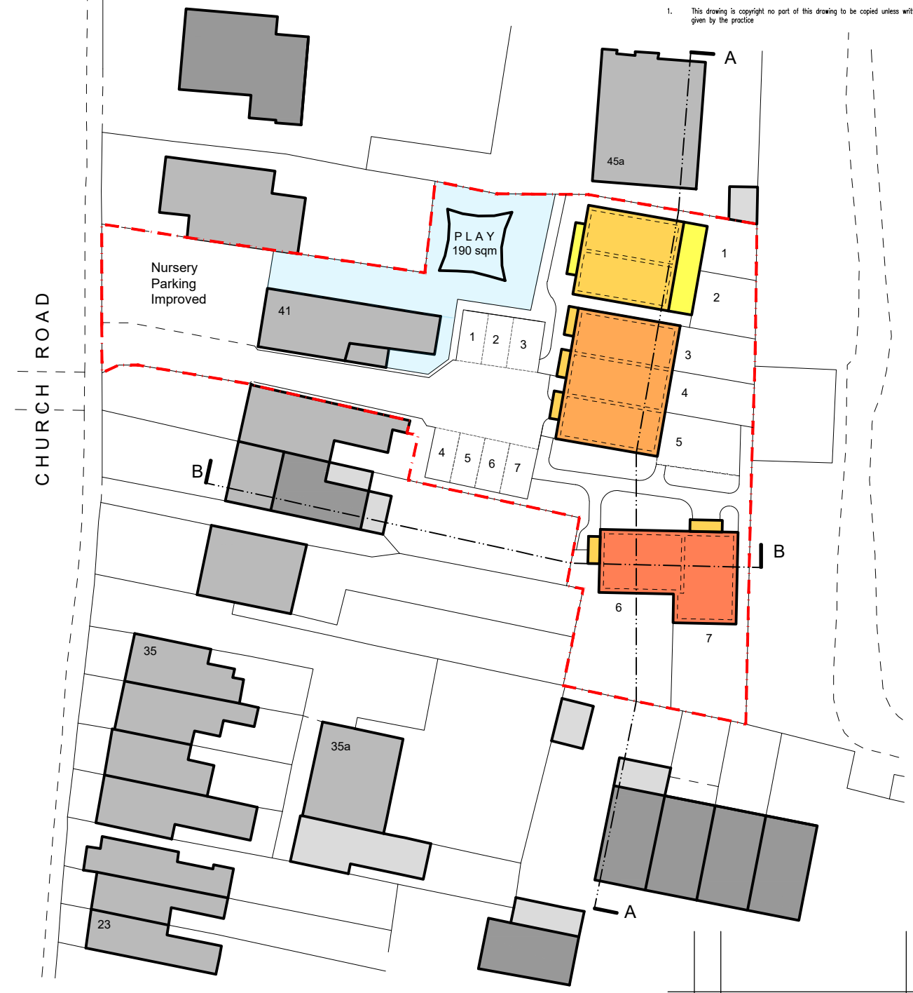
SITE CONTEXT PROPOSED