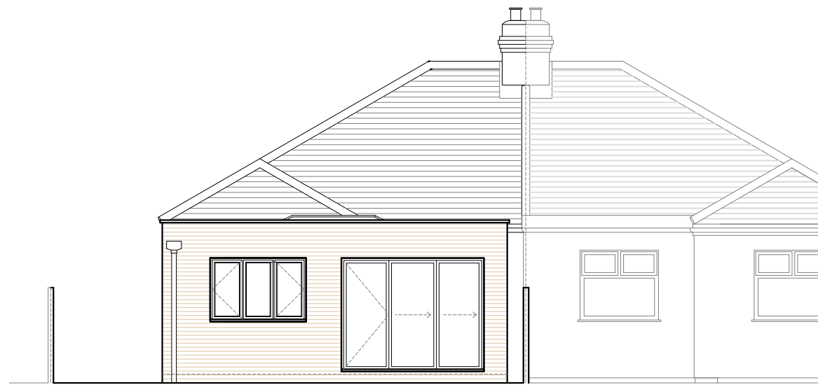
149 Blackfen Road 147 Blackfen Road Neighbouring property