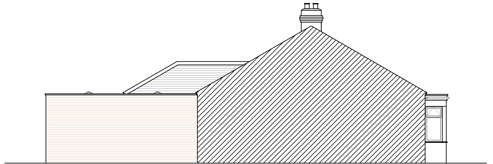
149 Blackfen Road