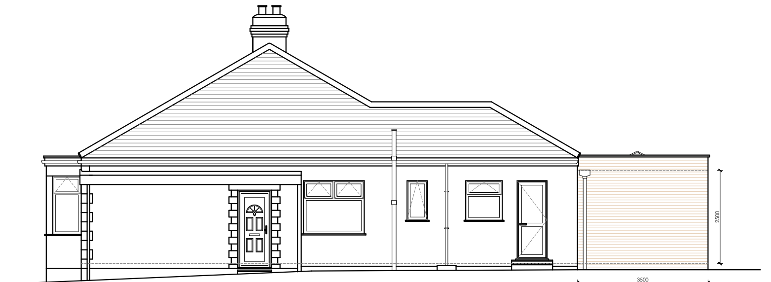
149 Blackfen Road