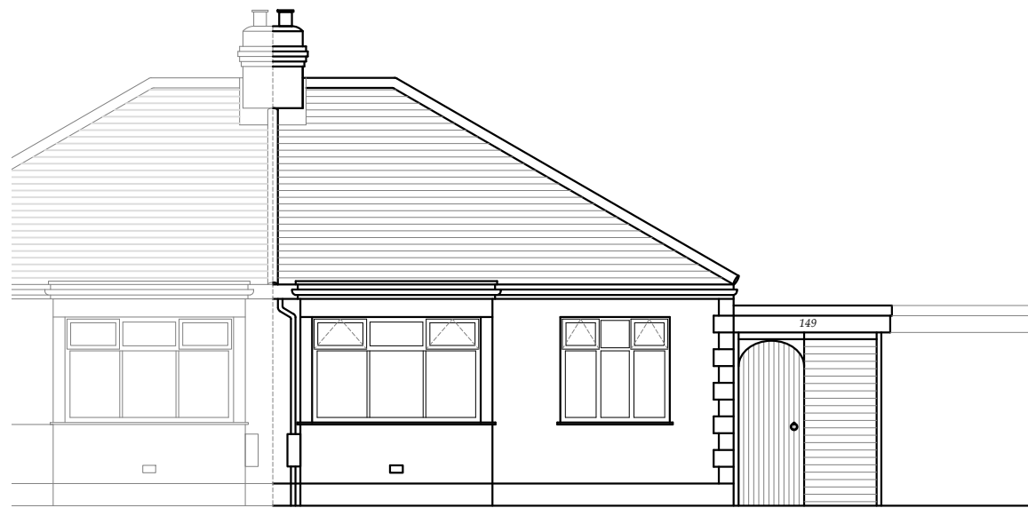
147 Blackfen Road Neighbouring property 149 Blackfen Road