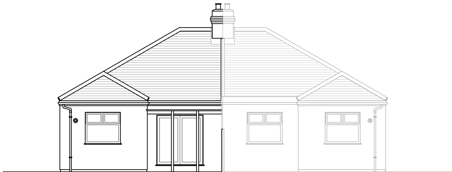
149 Blackfen Road