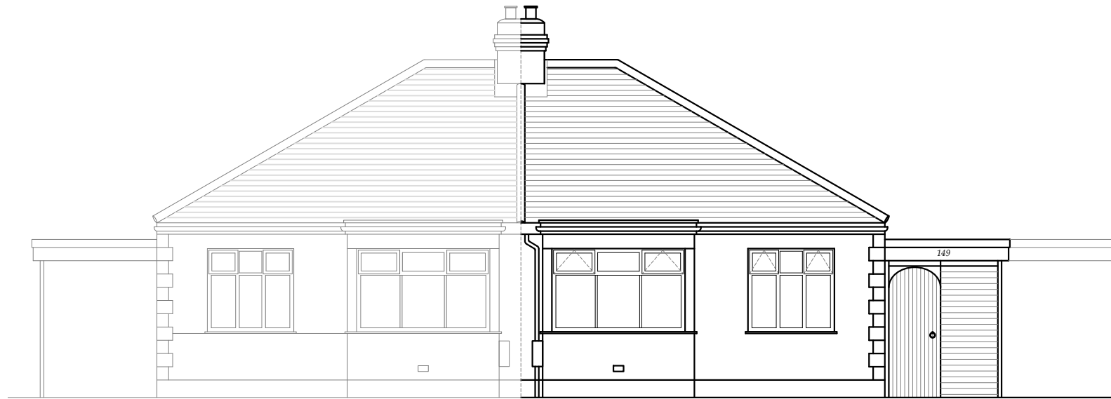
147 Blackfen Road Neighbouring property