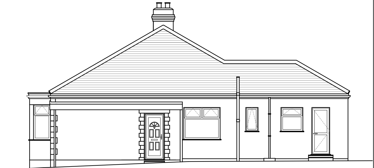
149 Blackfen Road