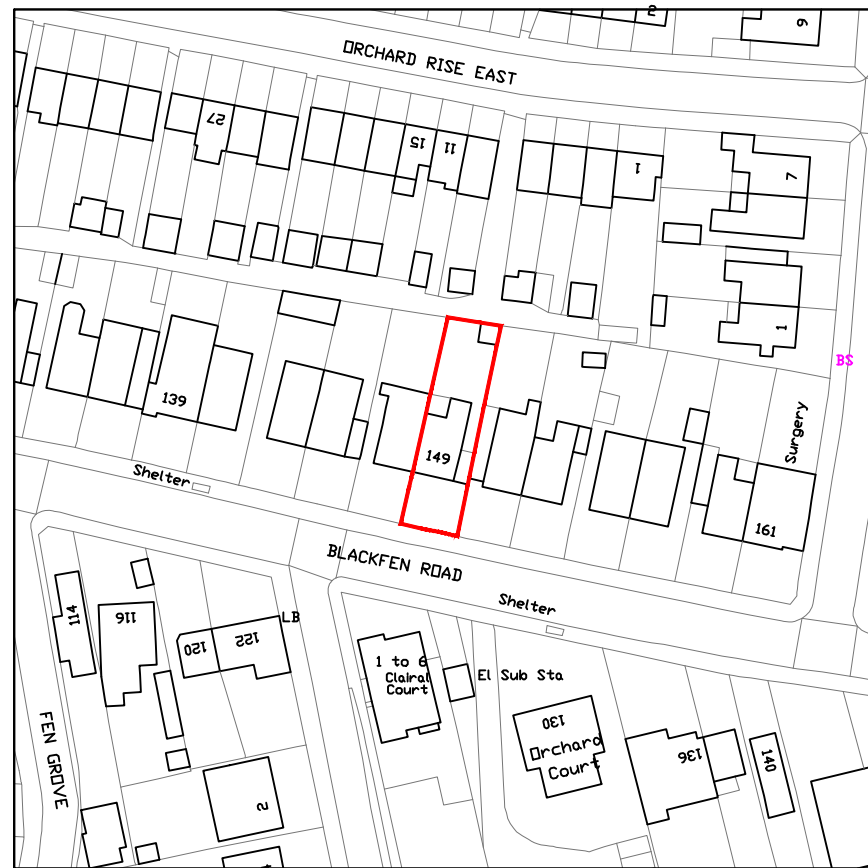
Location Map Scale : 1:1250