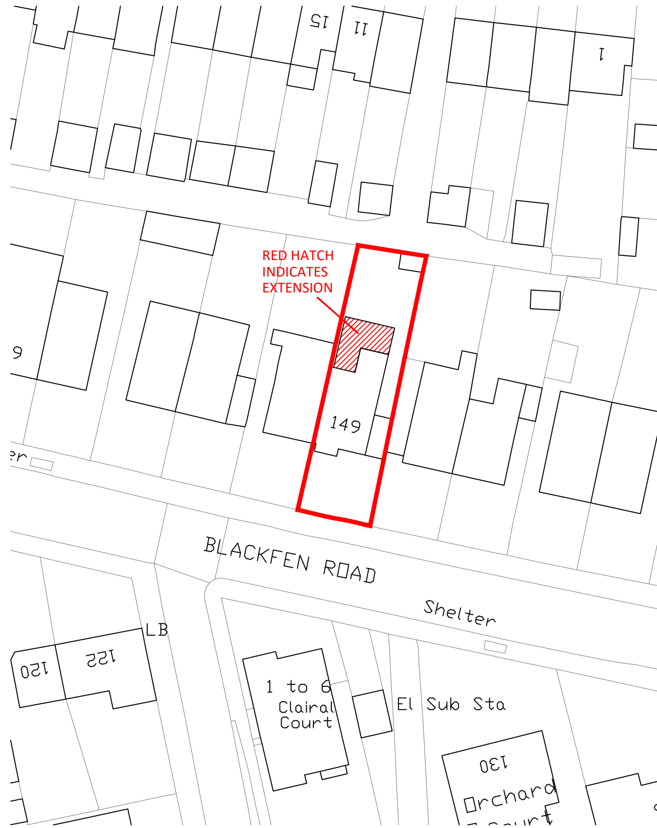
Site Plan Scale : 1:500